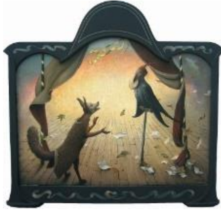
Le Corbeau et Renard