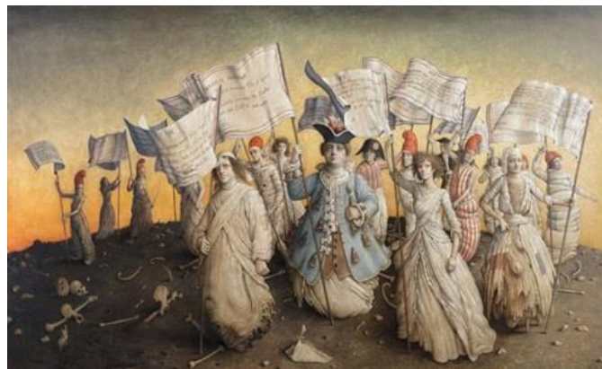
La R volution Francaise