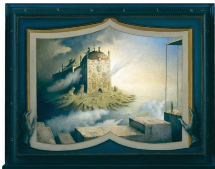
Les deux Mondes