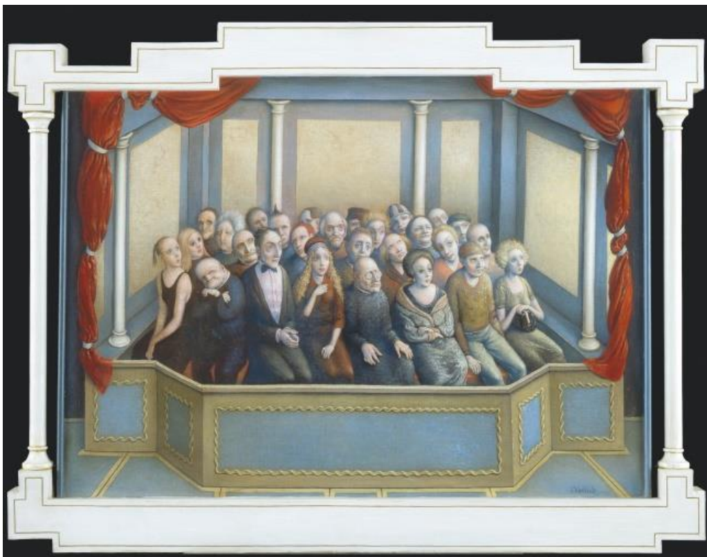
Mise en Scene