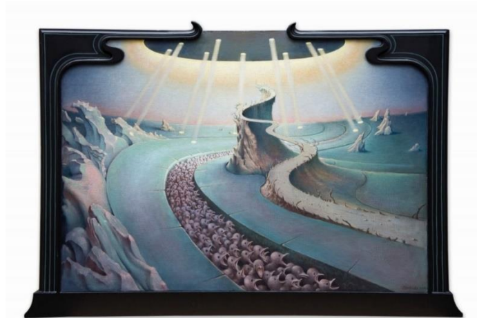
Le 2 Routes