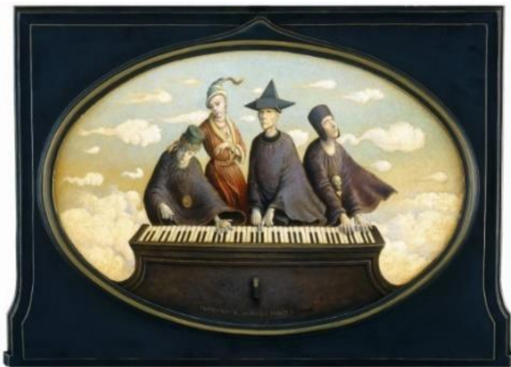
Morceau a quatres mains