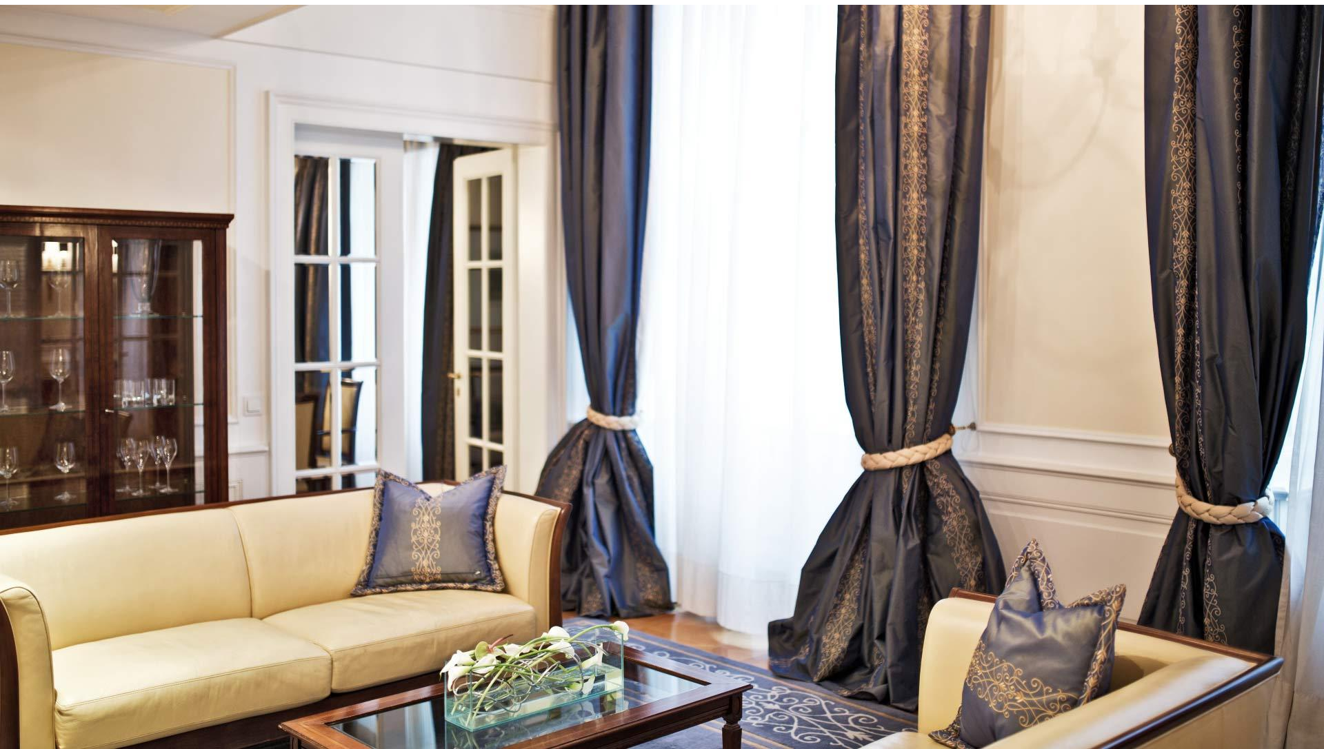
Bastei suite, Boris