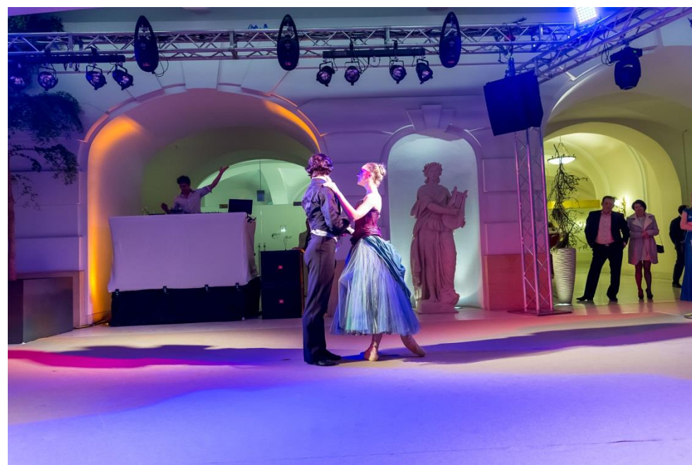
Christmas & New Year