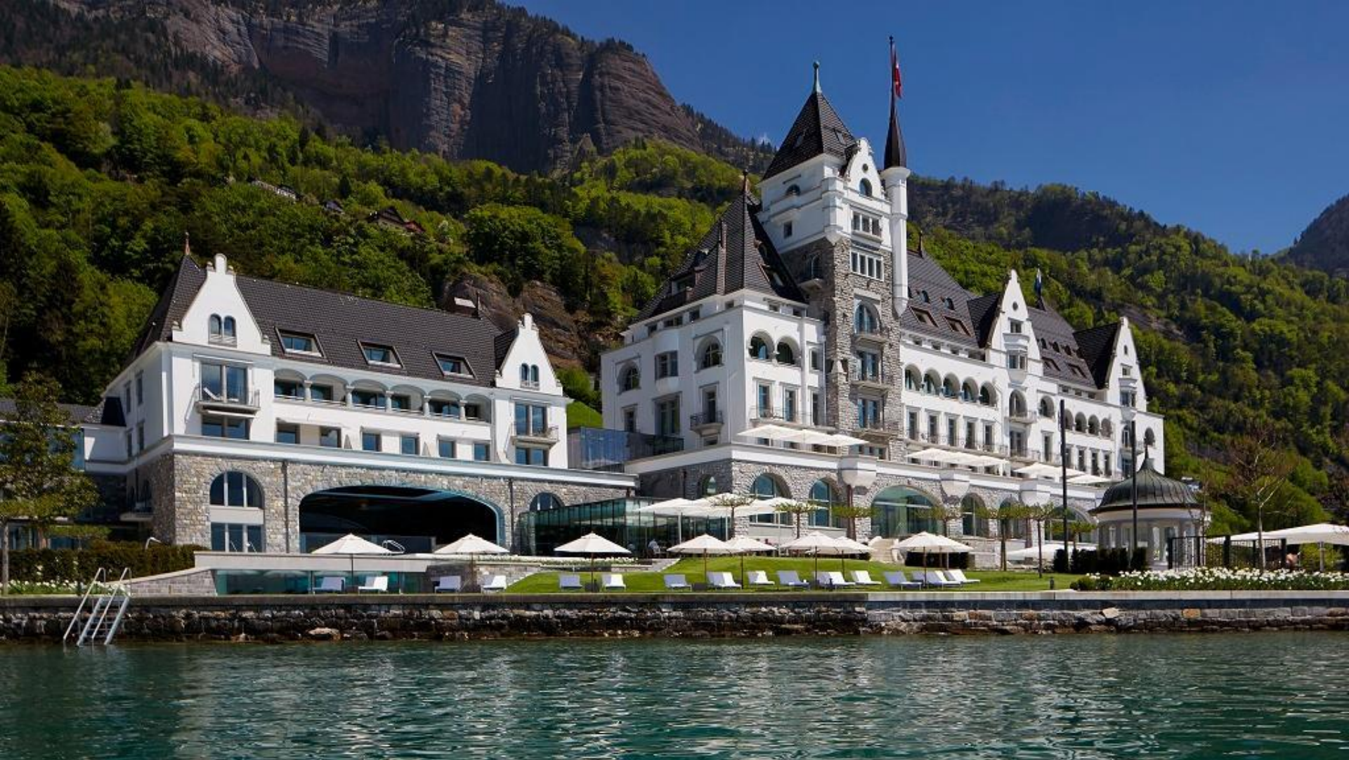
Park Hotel Vitznau