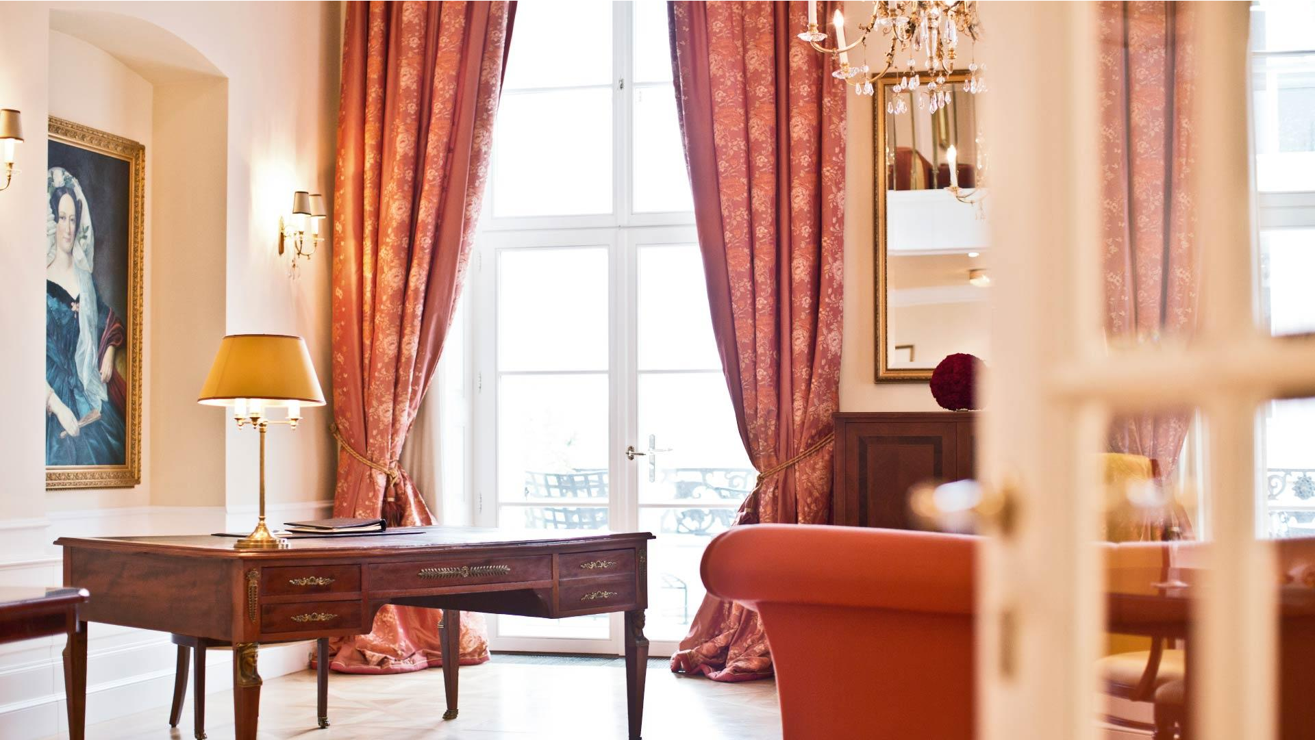
Coburg suite, Marie-Antonie