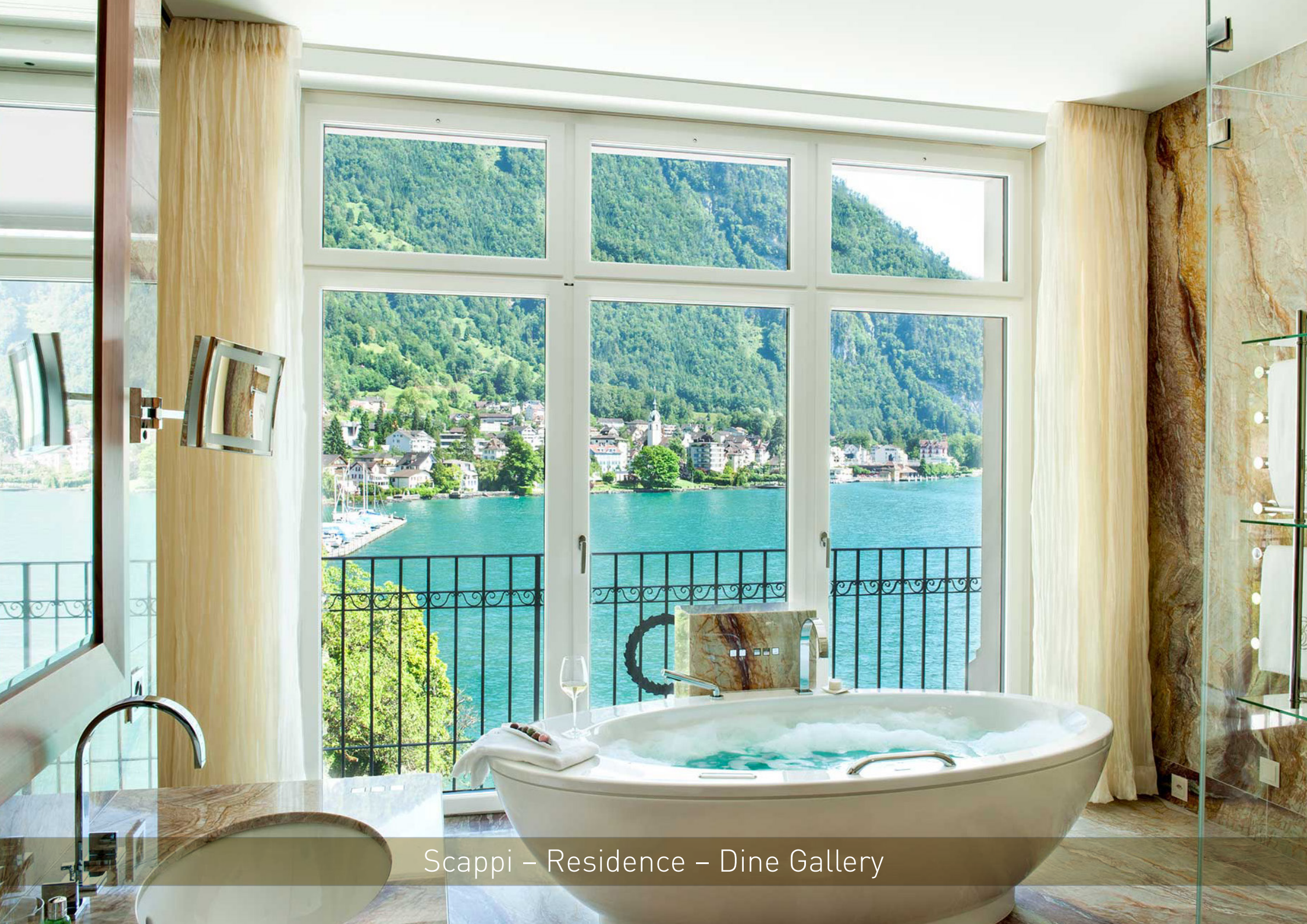
Scappi – Residence – Dine Gallery