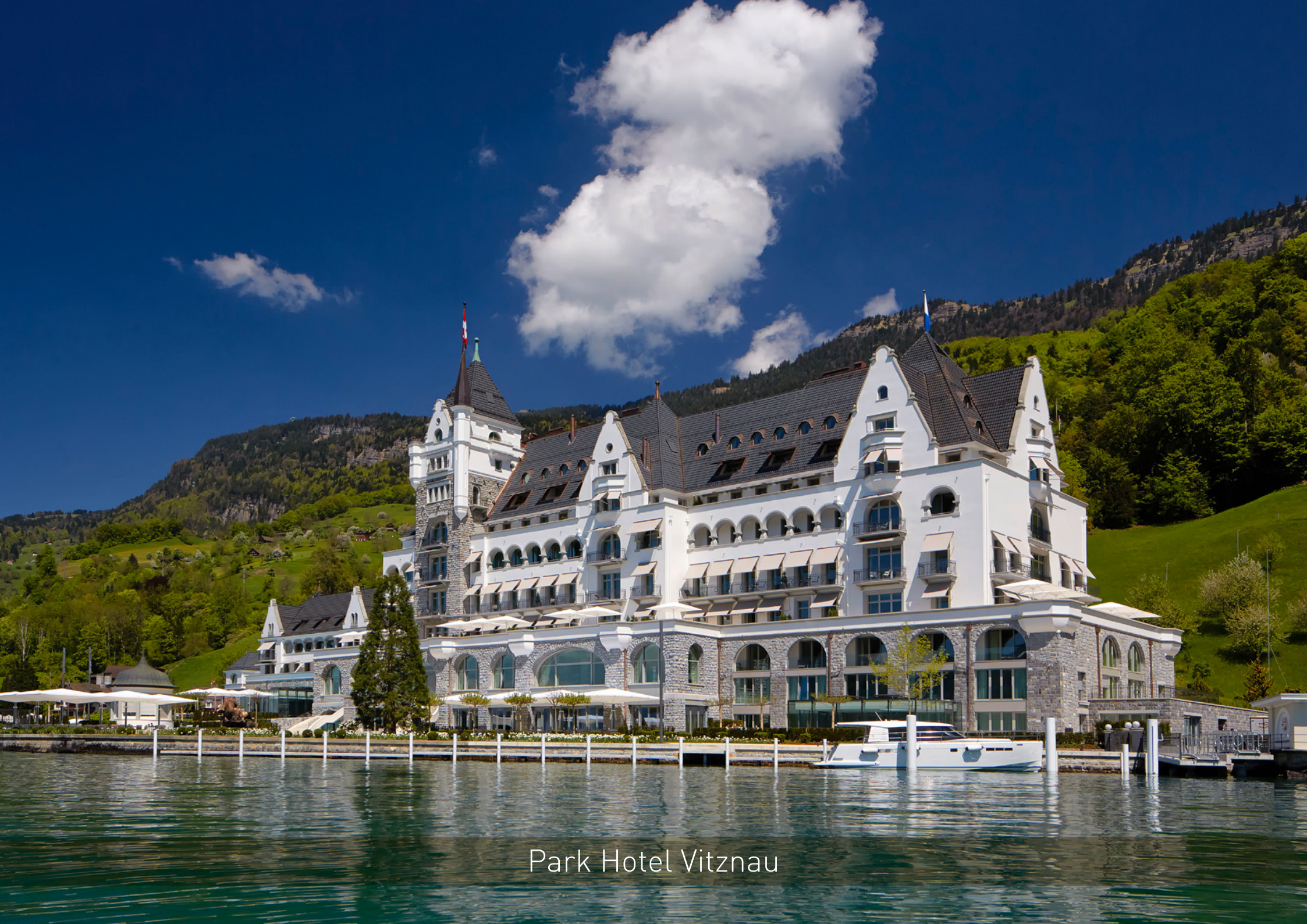
Park Hotel Vitznau