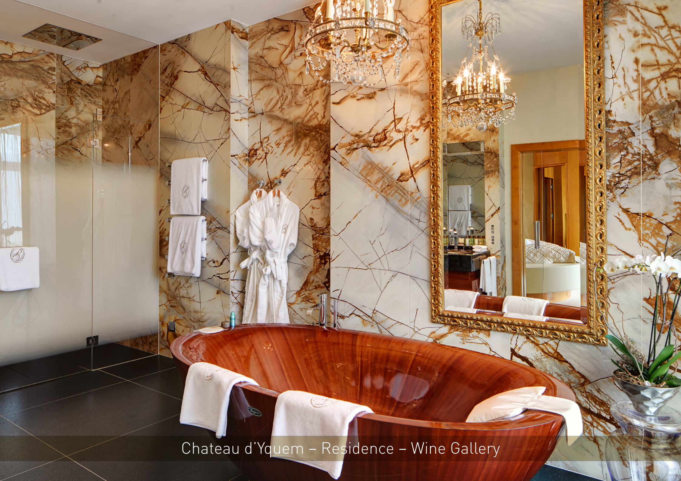
Chateau d'Yquem – Residence – Wine Gallery