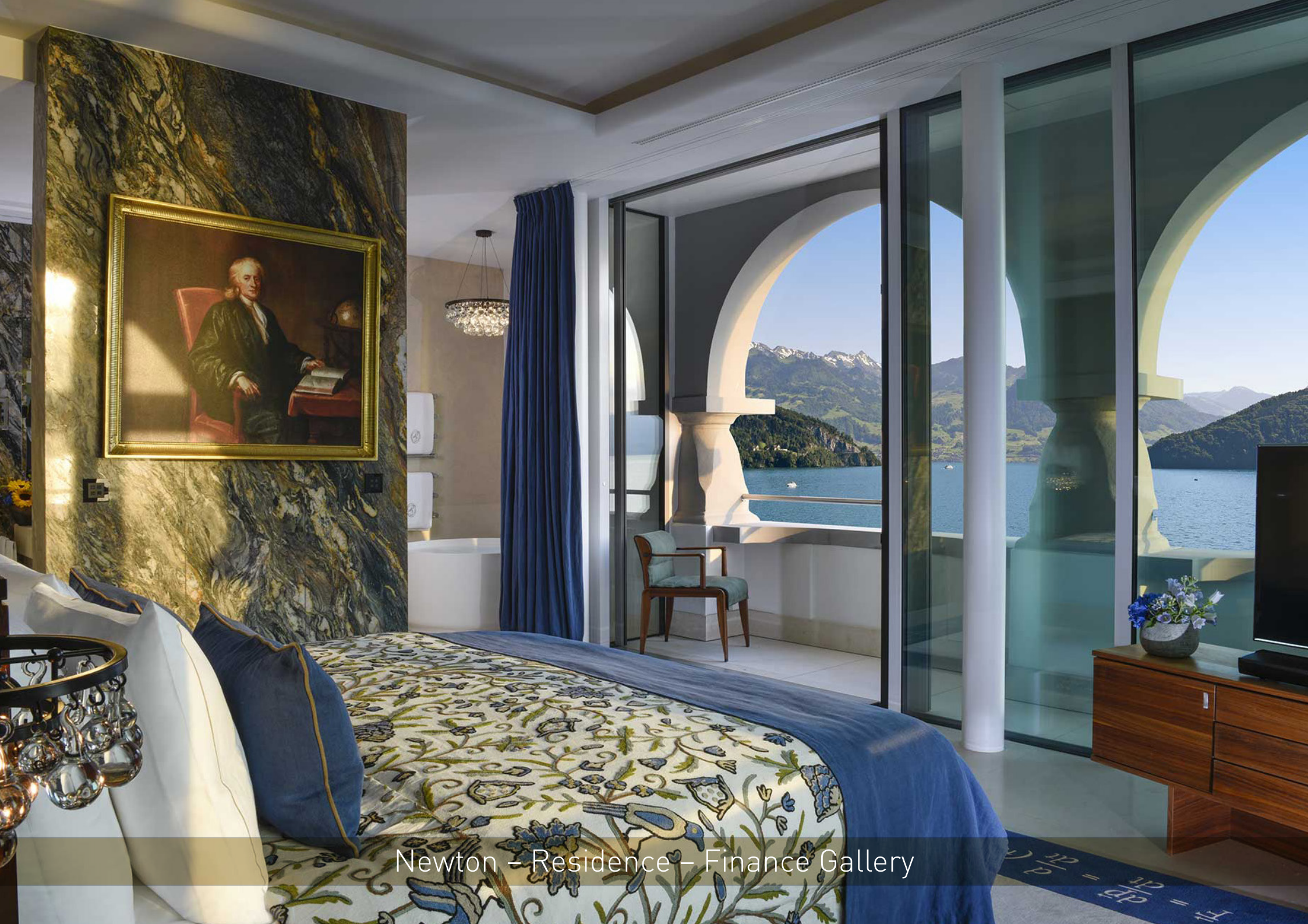
Newton - Residence - Finance Gallery