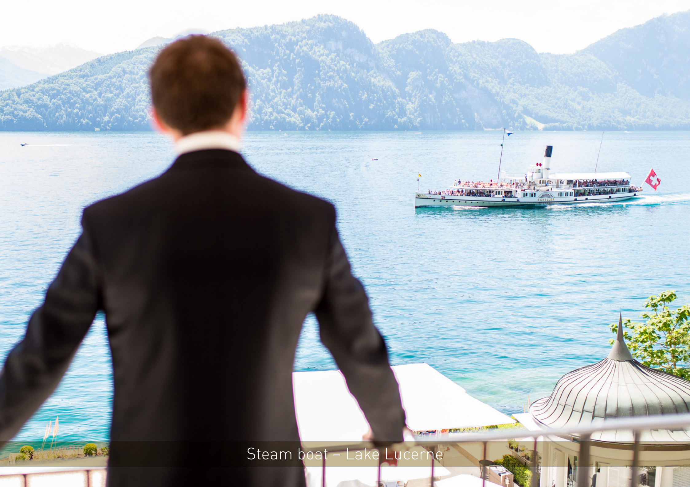
Steam boat – Lake Lucerne