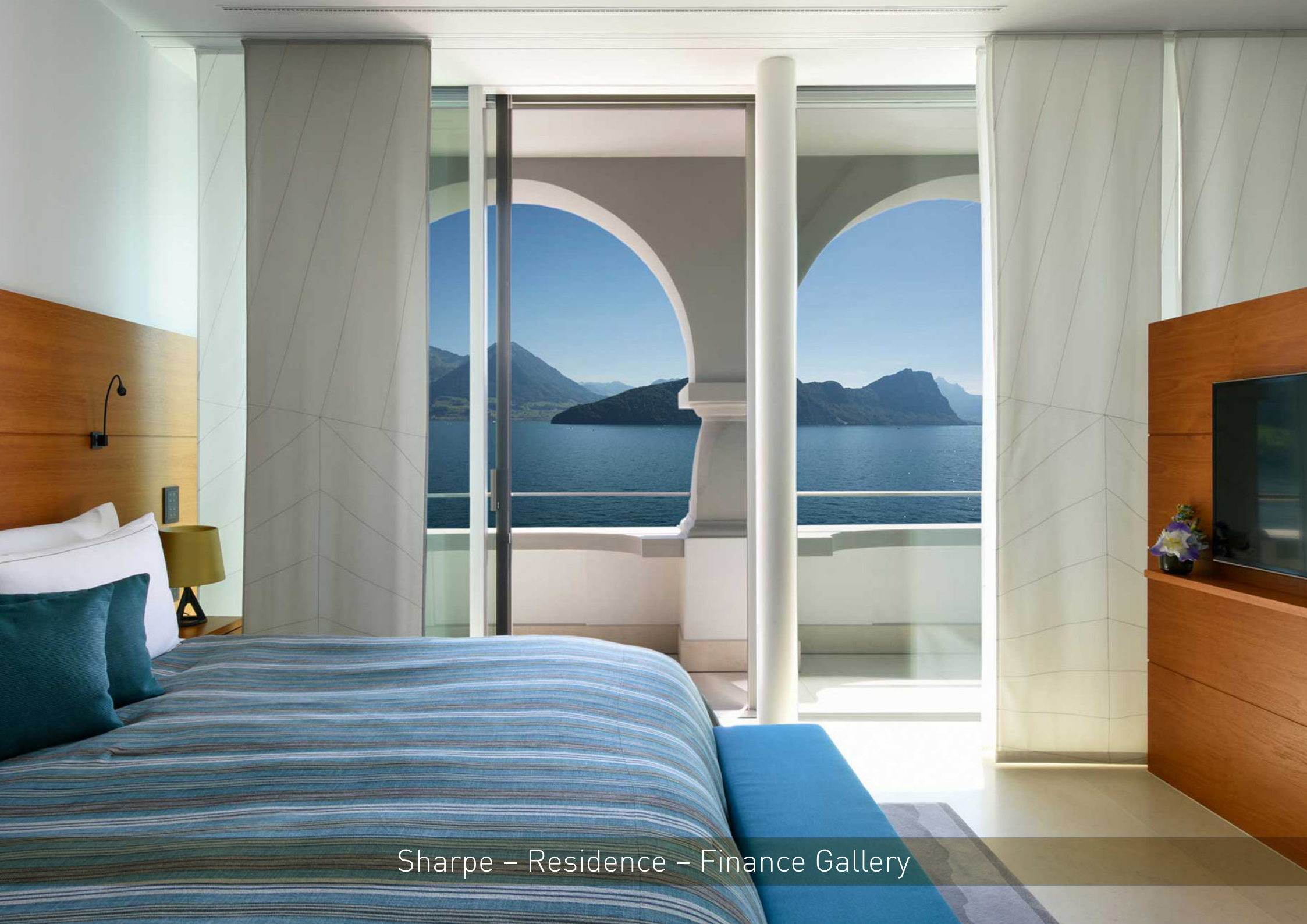
Sharpe – Residence – Finance Gallery