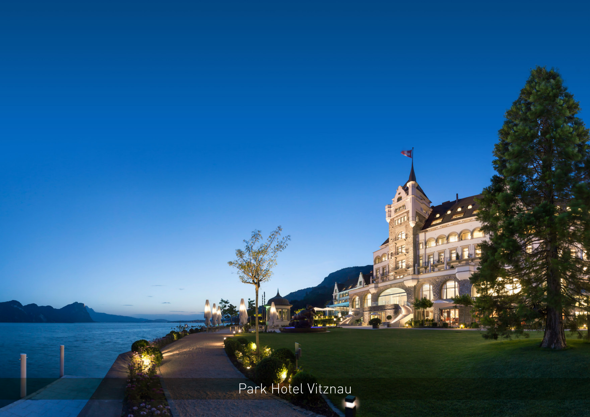
Park Hotel Vitznau