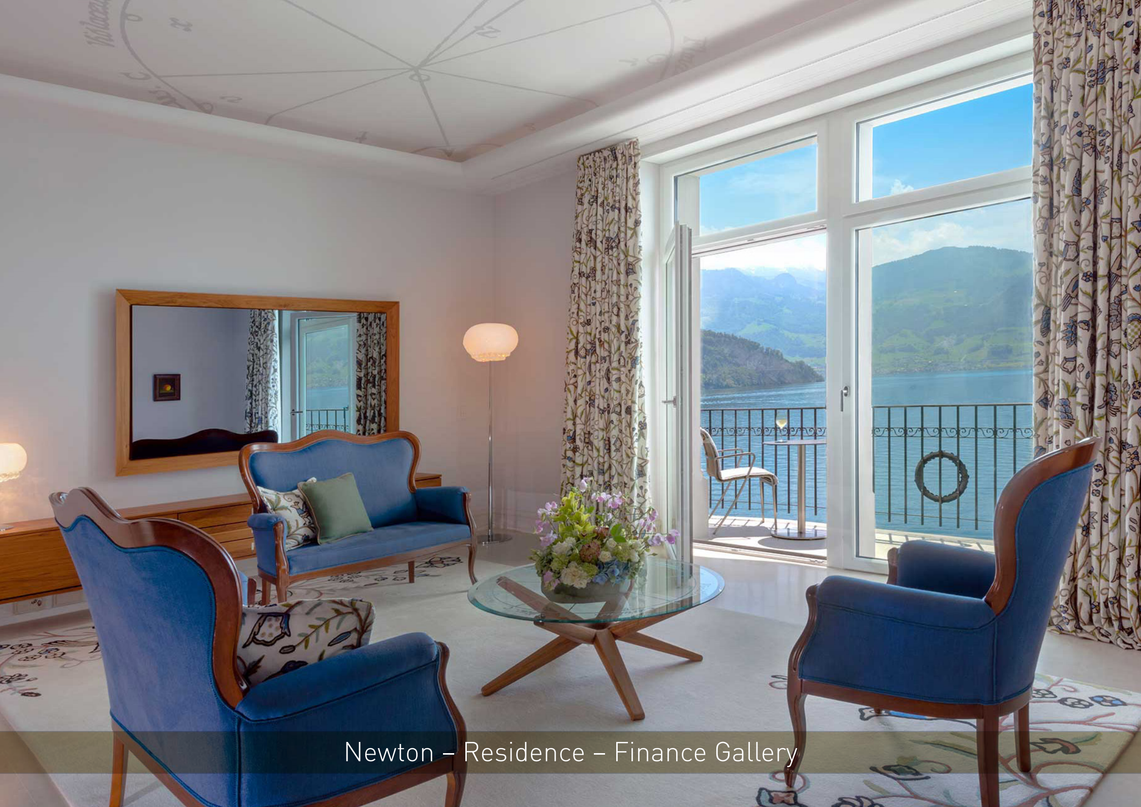
Newton – Residence – Finance Gallery