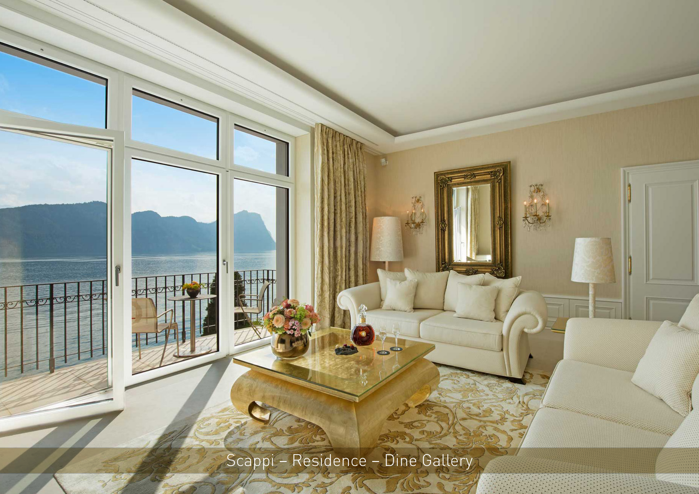
Scappi – Residence – Dine Gallery