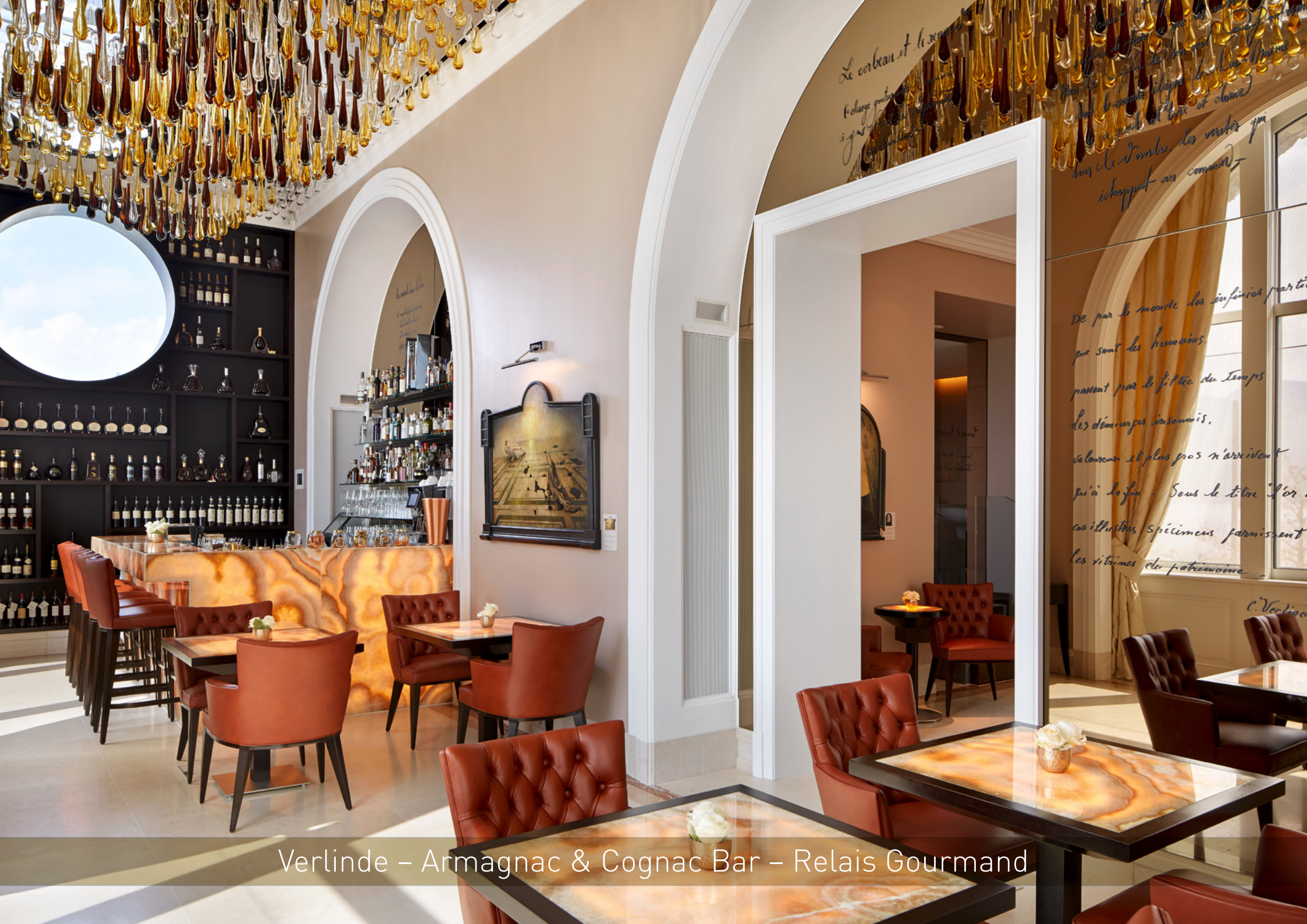
Verlinde – Armagnac & Cognac Bar – Relais Gourmand