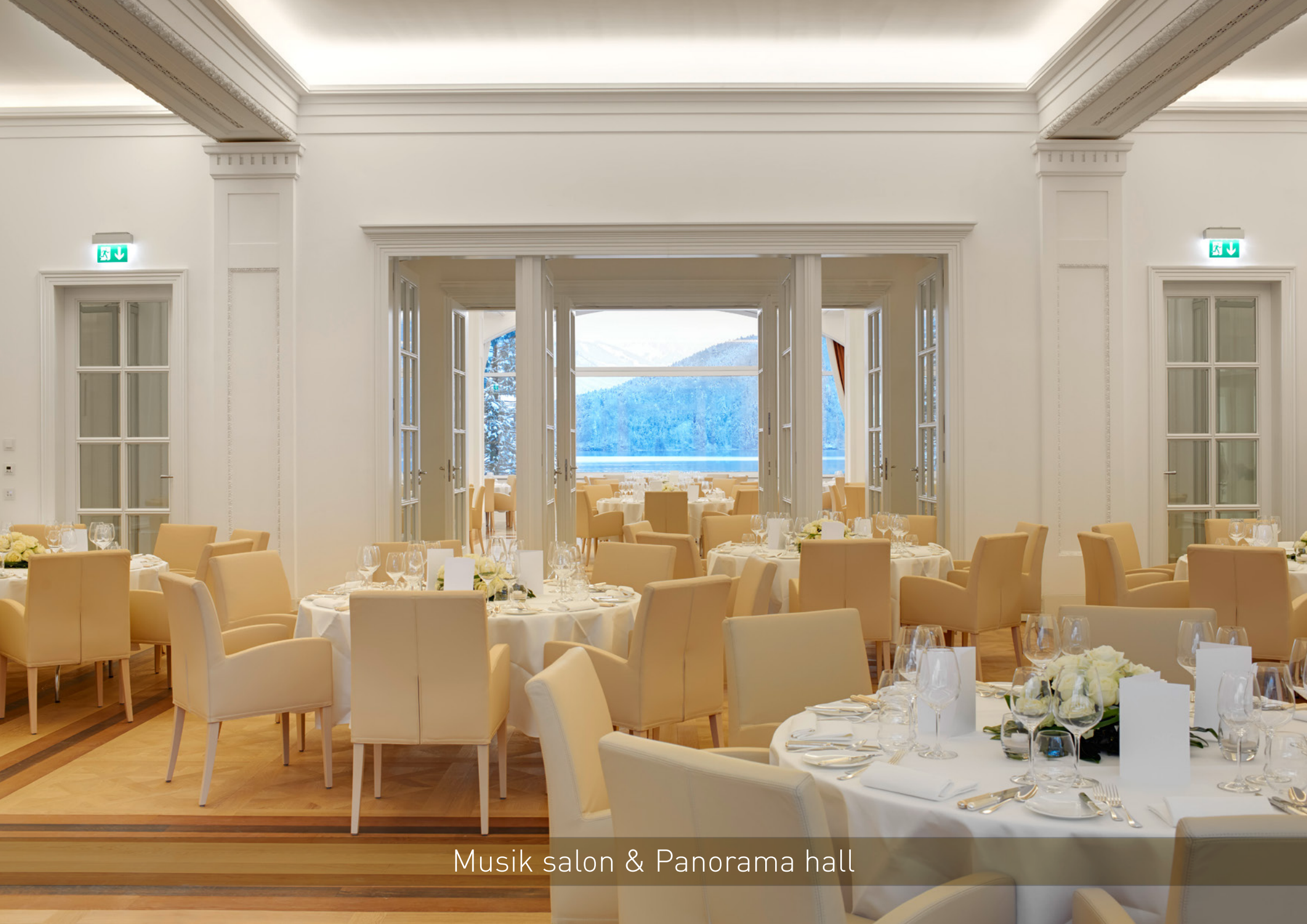
Musik salon & Panorama hall