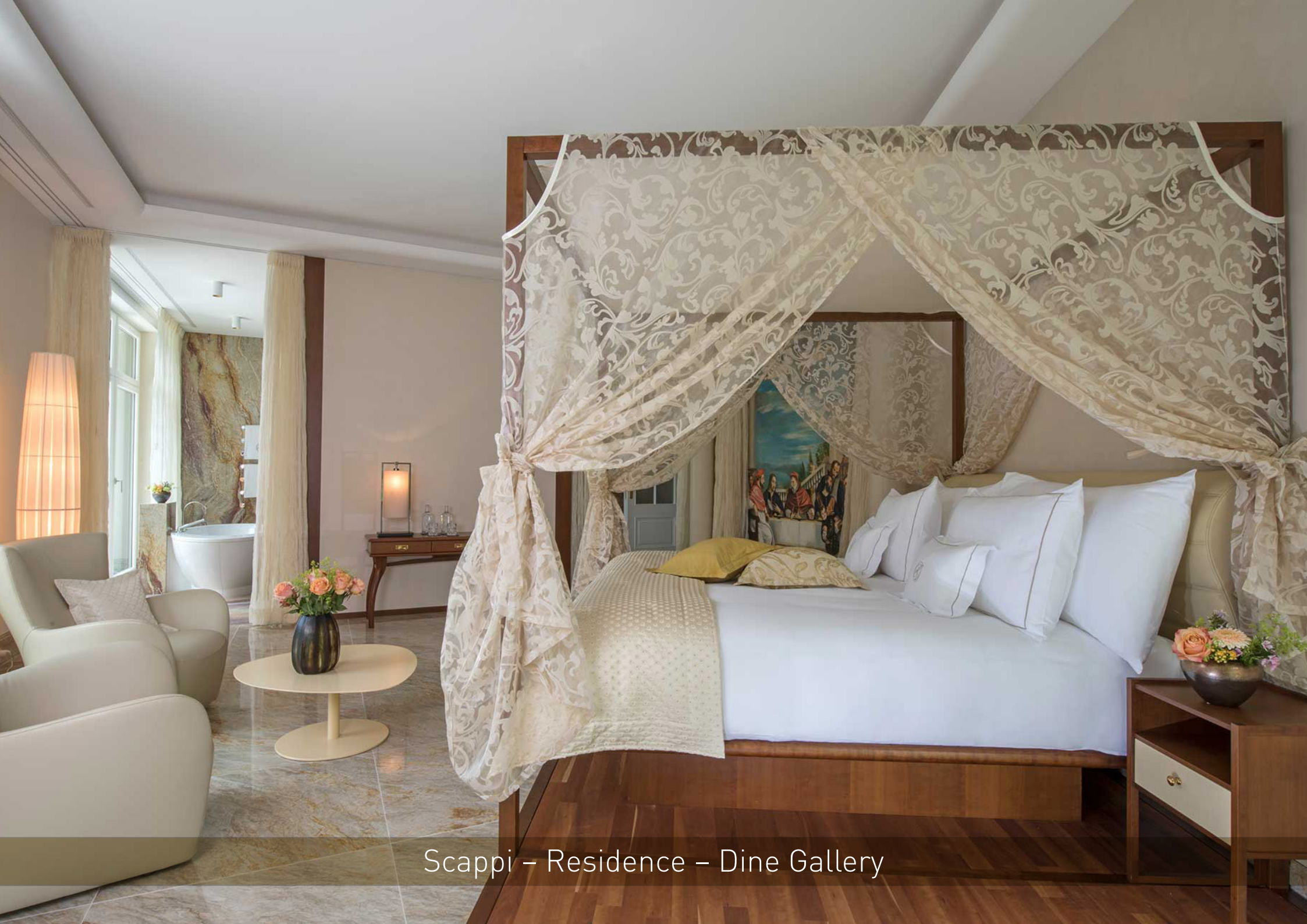
Scappi – Residence – Dine Gallery