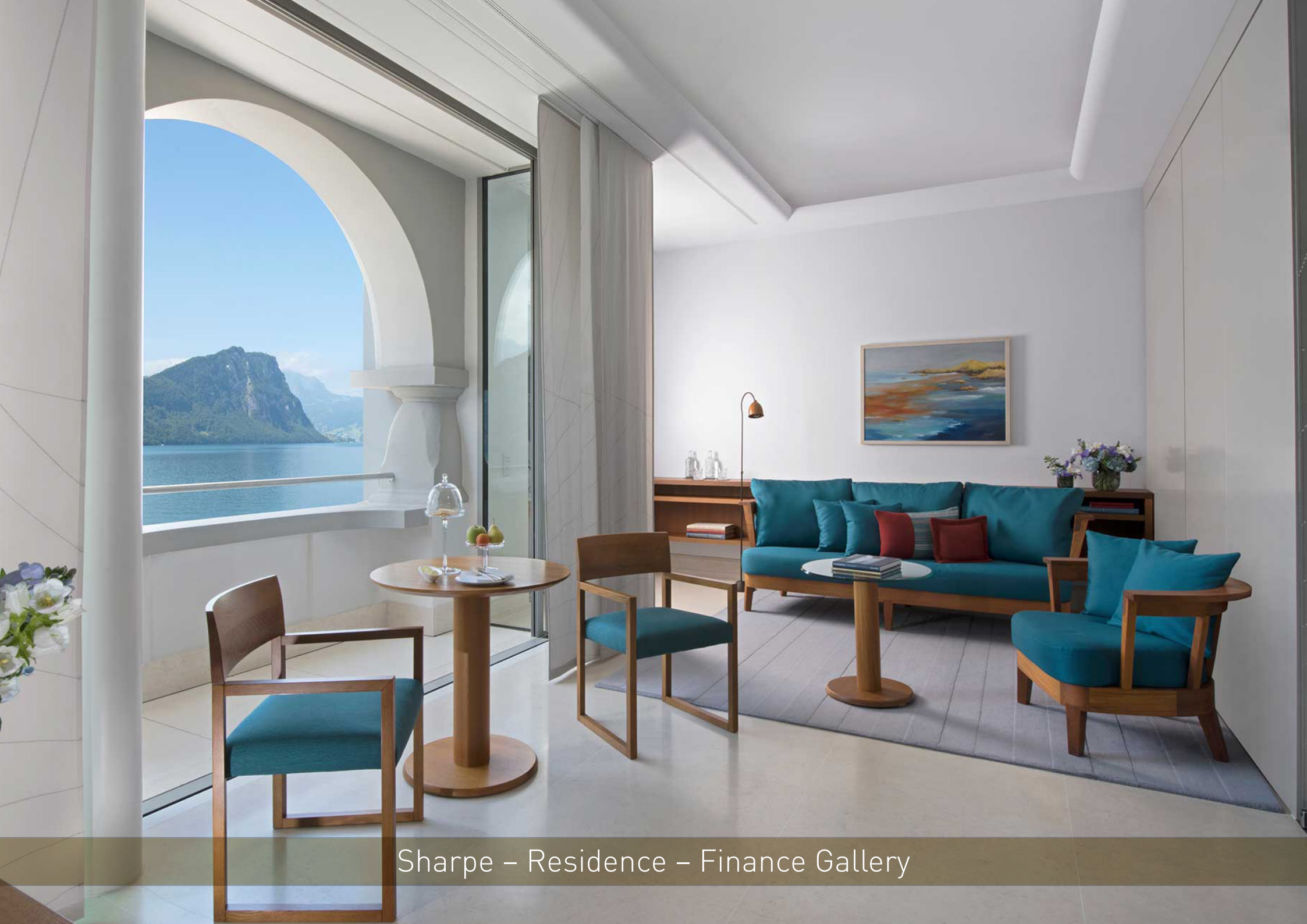
Sharpe – Residence – Finance Gallery