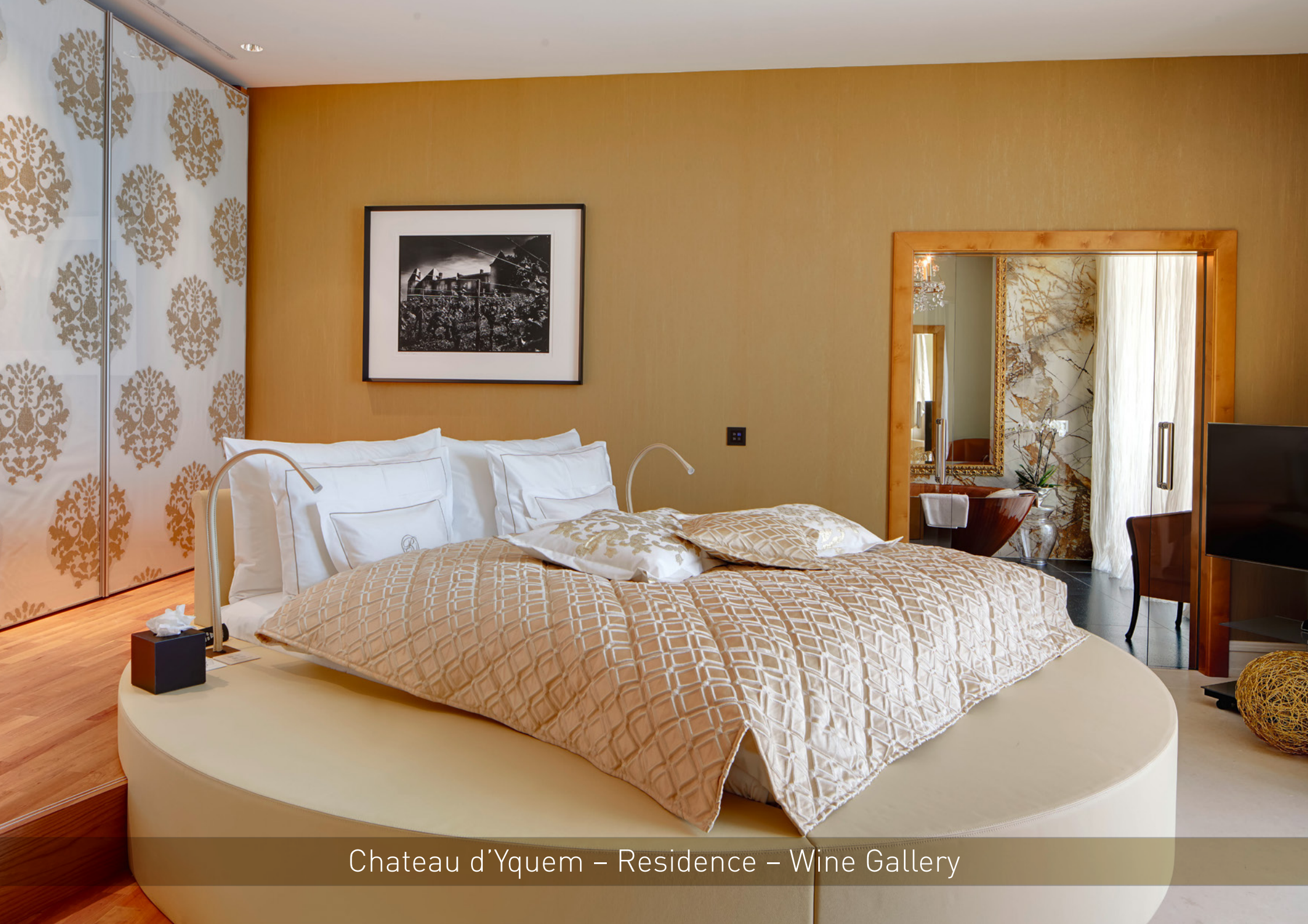
Chateau d'Yquem – Residence – Wine Gallery