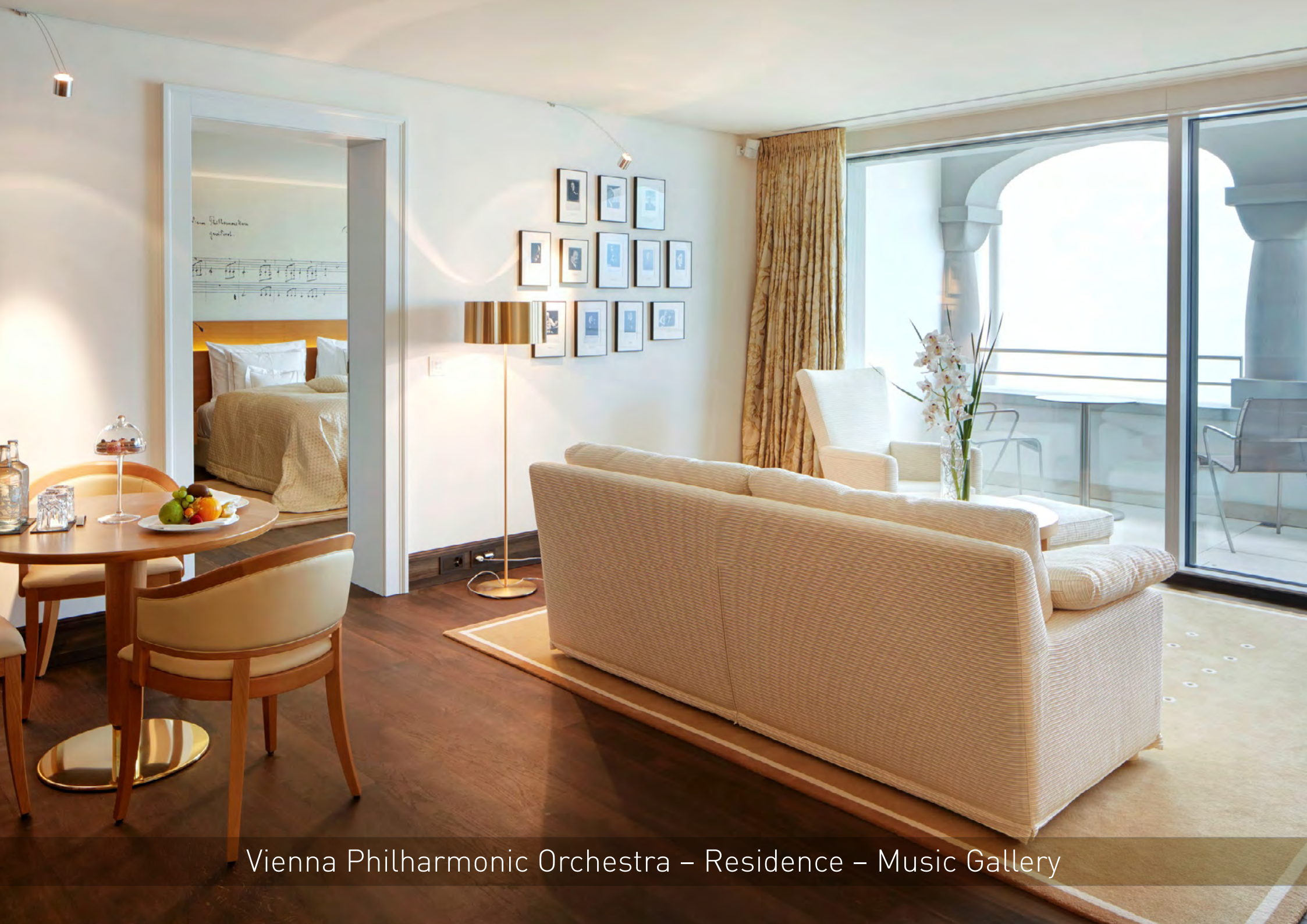
Vienna Philharmonic Orchestra – Residence – Music Gallery