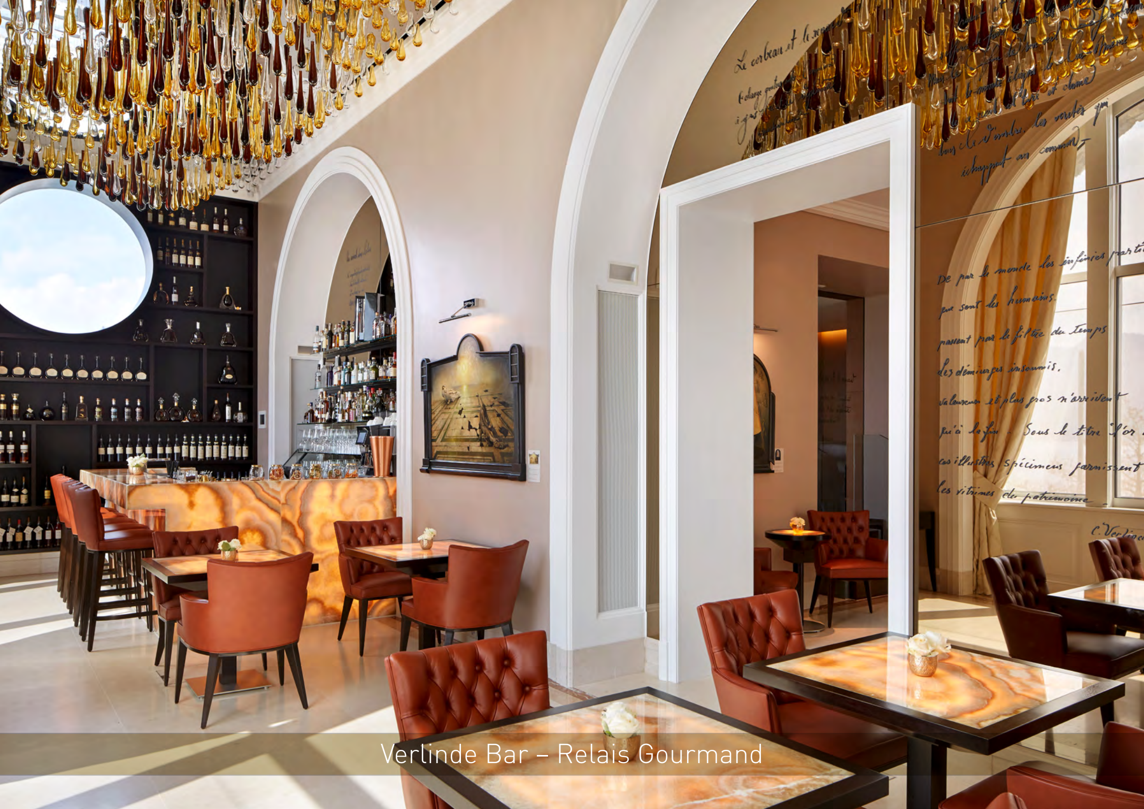
Verlinde Bar – Relais Gourmand

Le corbeau et le renard L'oiseau qui se vante à gaspiller son grain Mais le renard se moque de son orgueil Et dit : le monde est plein de gens qui se vantent sans le savoir Et qui échappent au commandement