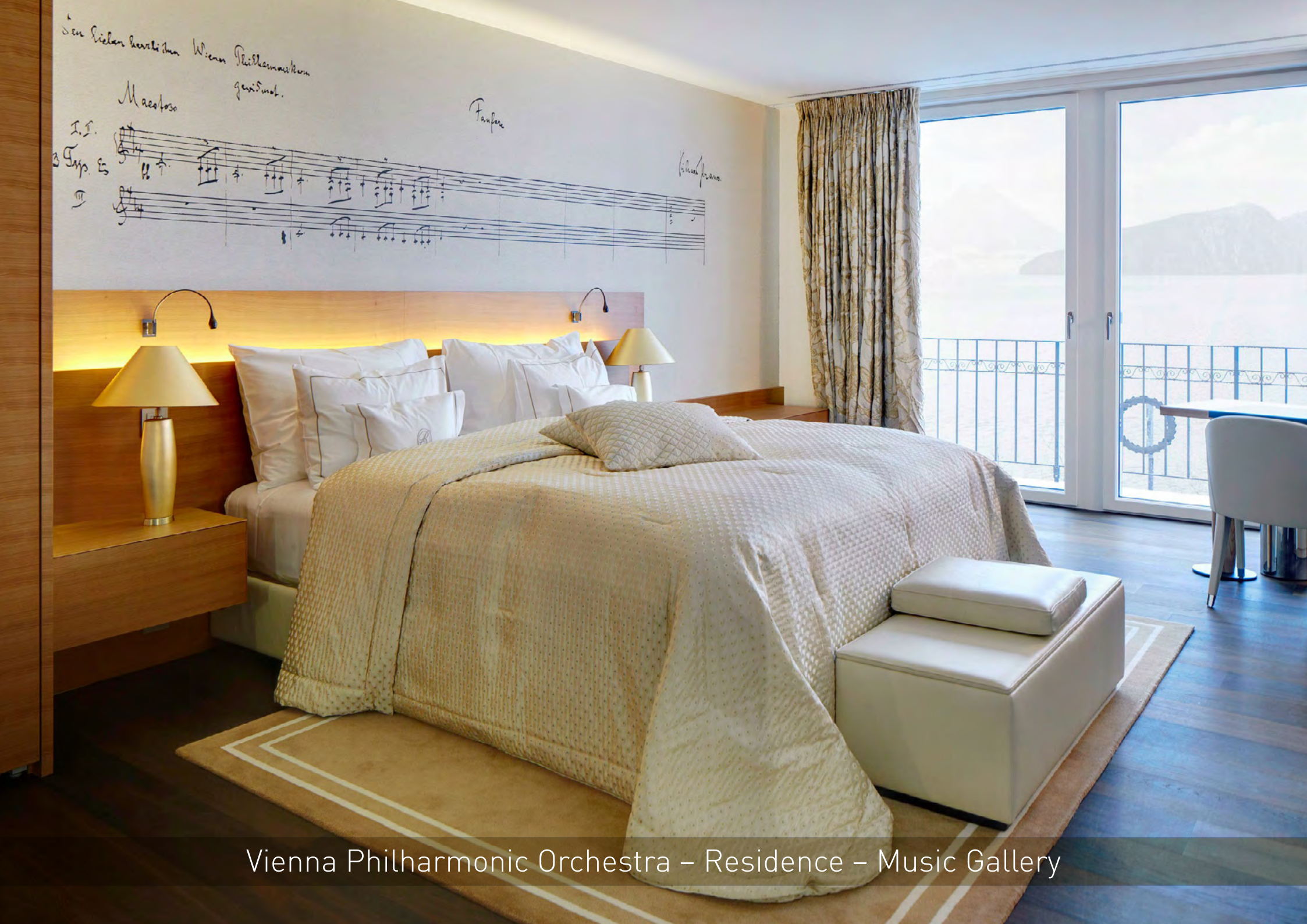
Vienna Philharmonic Orchestra – Residence – Music Gallery