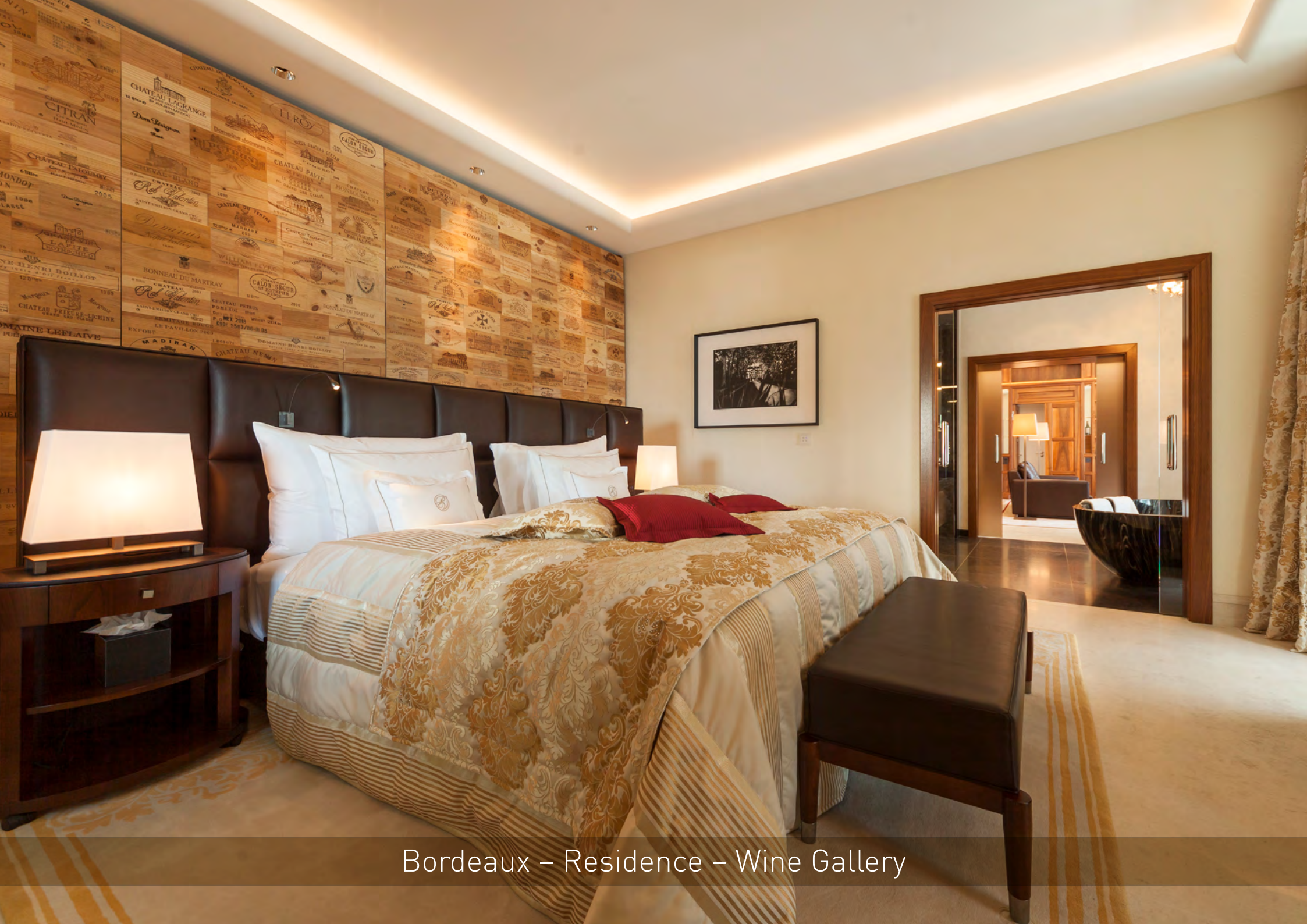
Bordeaux – Residence – Wine Gallery