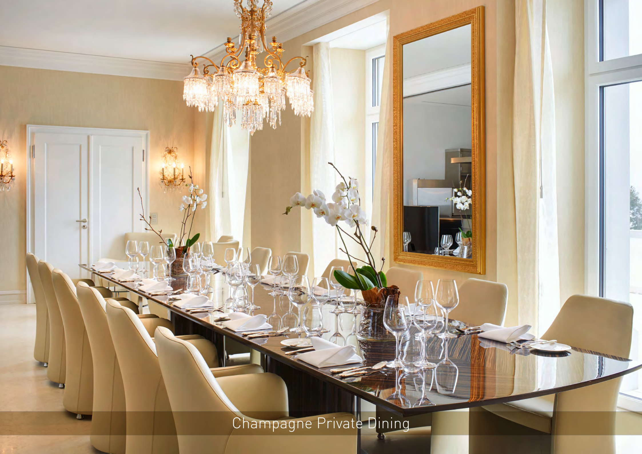
Champagne Private Dining