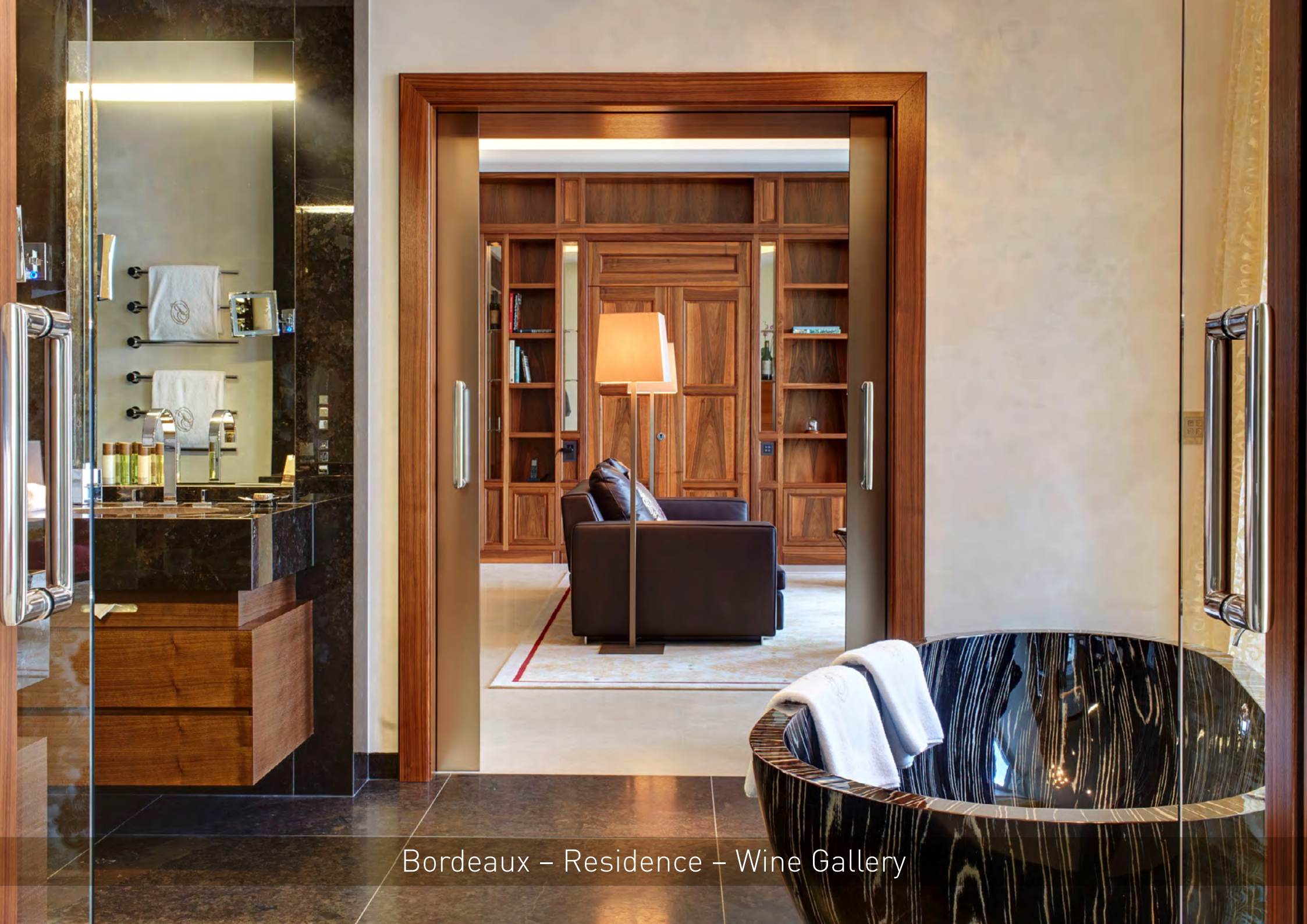
Bordeaux – Residence – Wine Gallery