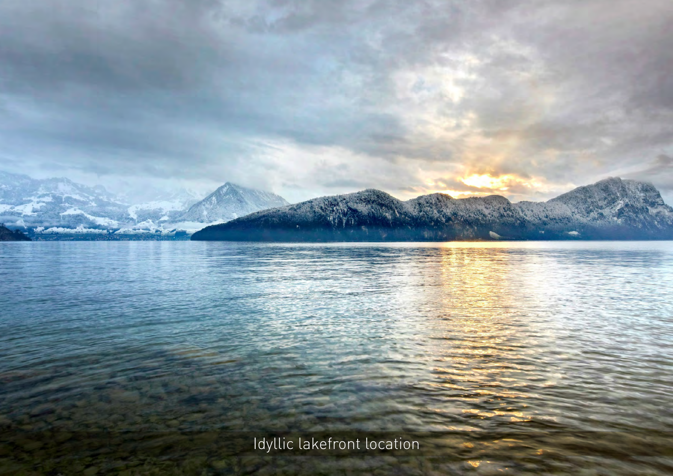
Idyllic lakefront location