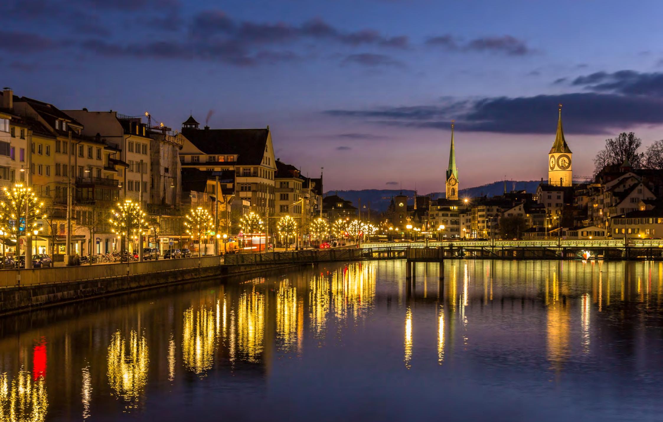
Zurich – Bahnhofstrasse – Shopping