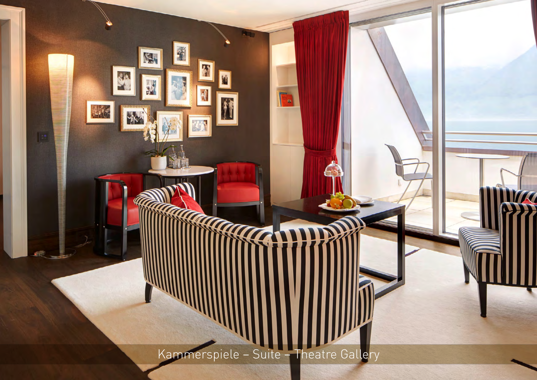
Kammerspiele – Suite – Theatre Gallery