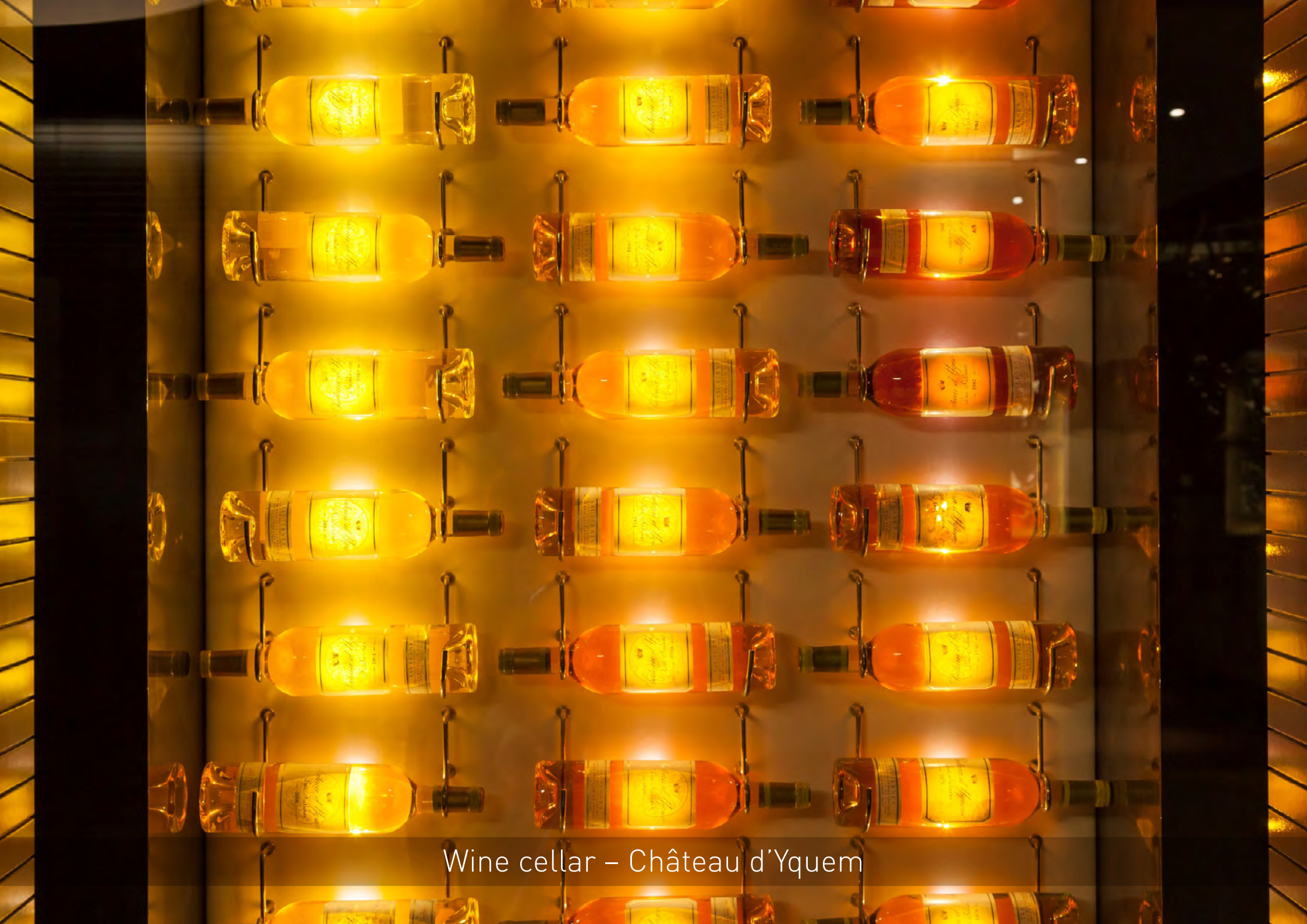
Wine cellar – Château d'Yquem