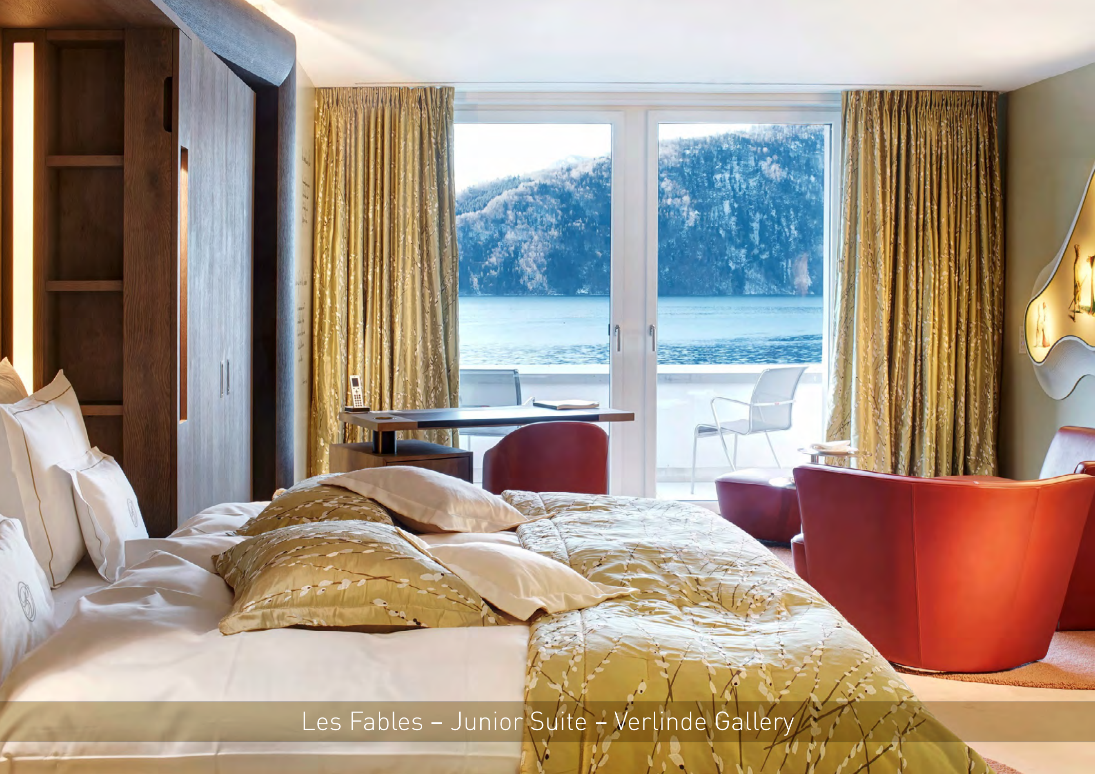
Les Fables – Junior Suite – Verlinde Gallery