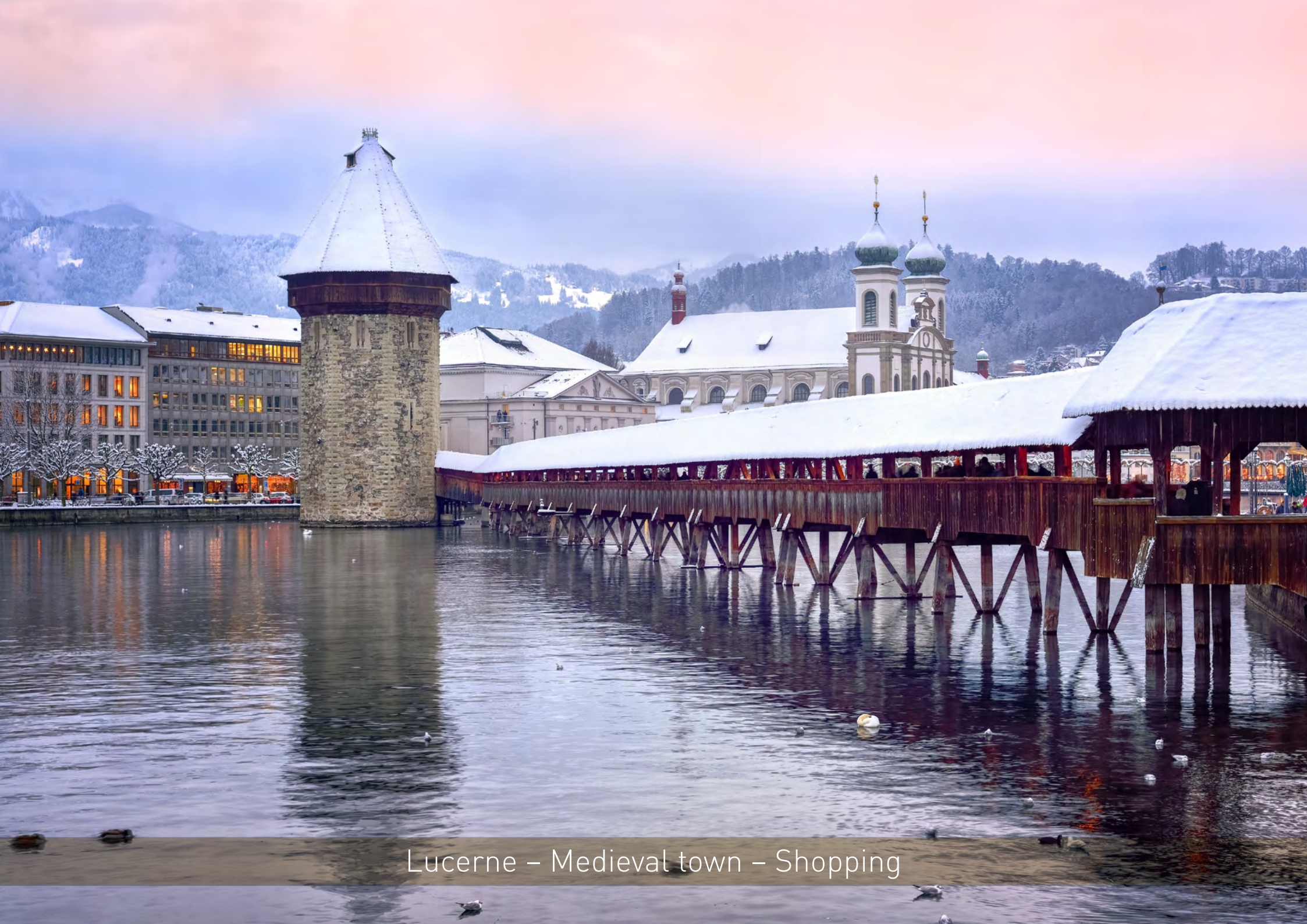
Lucerne – Medieval town – Shopping