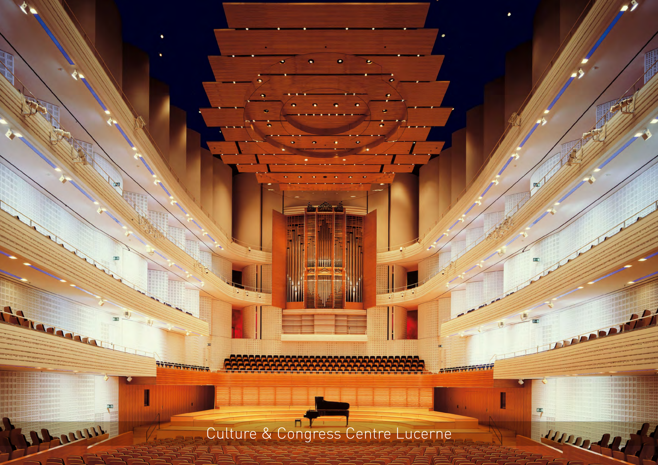
Culture & Congress Centre Lucerne