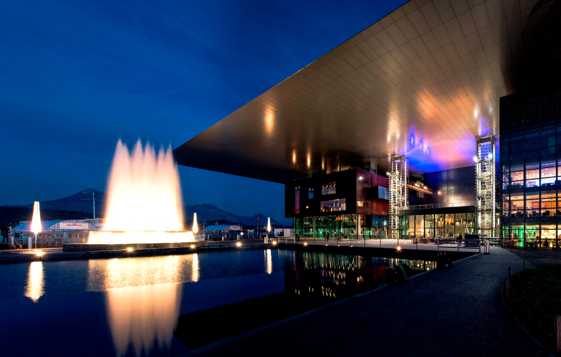
Culture & Congress Centre Lucerne