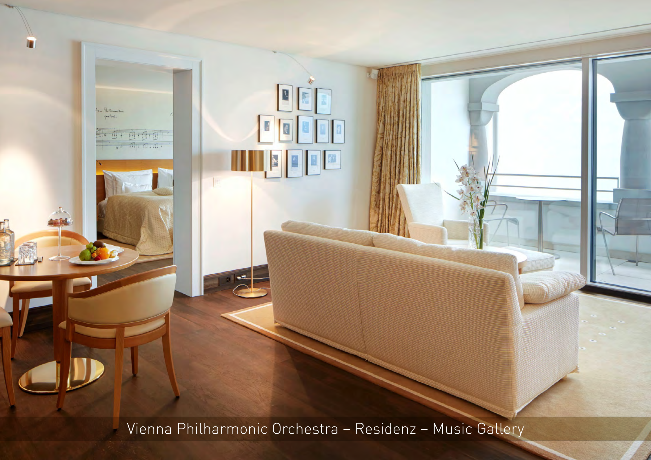
Vienna Philharmonic Orchestra – Residenz – Music Gallery