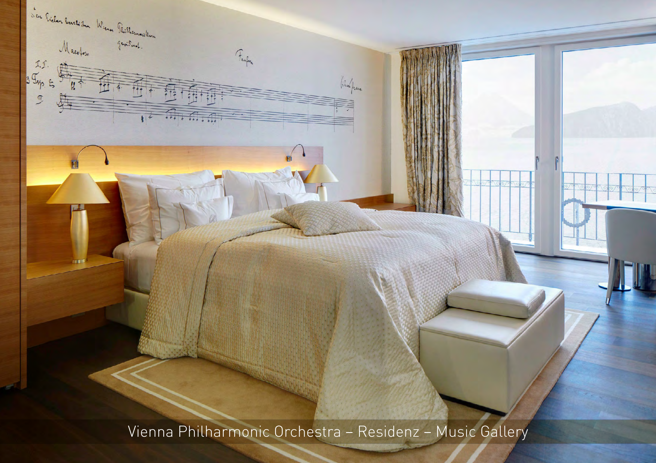
Vienna Philharmonic Orchestra – Residenz – Music Gallery