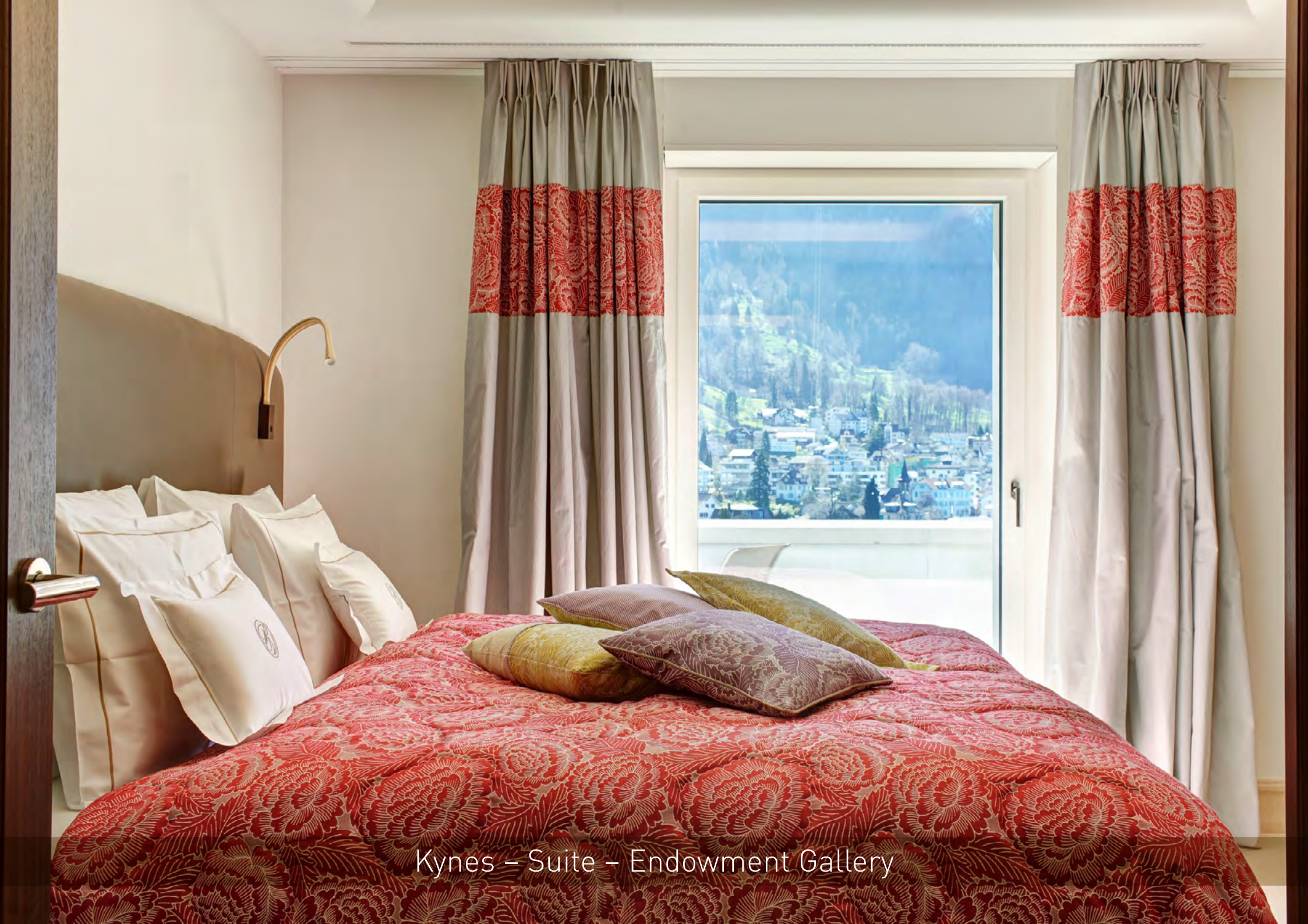
Kynes – Suite – Endowment Gallery