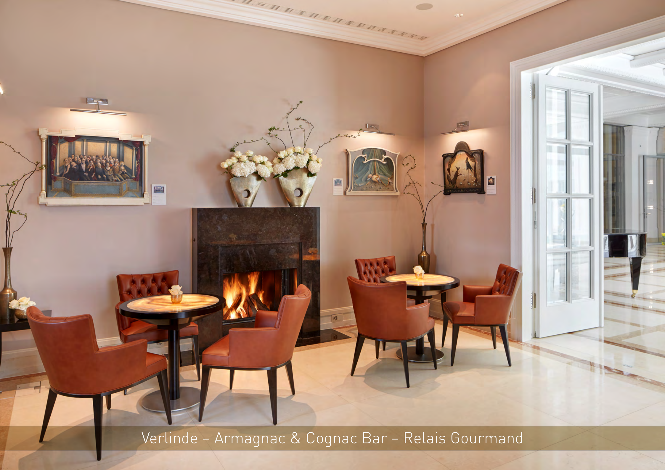
Verlinde – Armagnac & Cognac Bar – Relais Gourmand