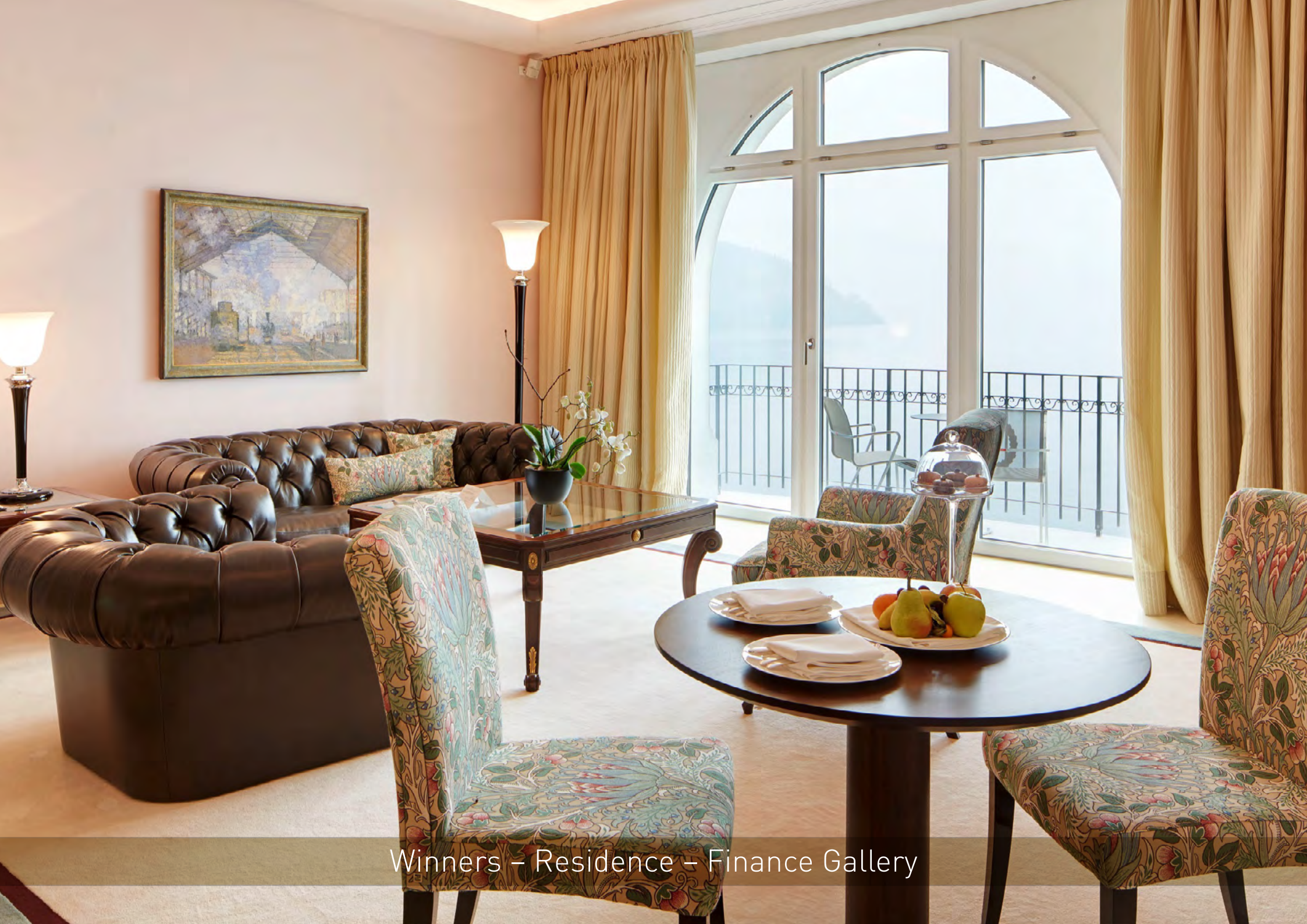
Winners – Residence – Finance Gallery