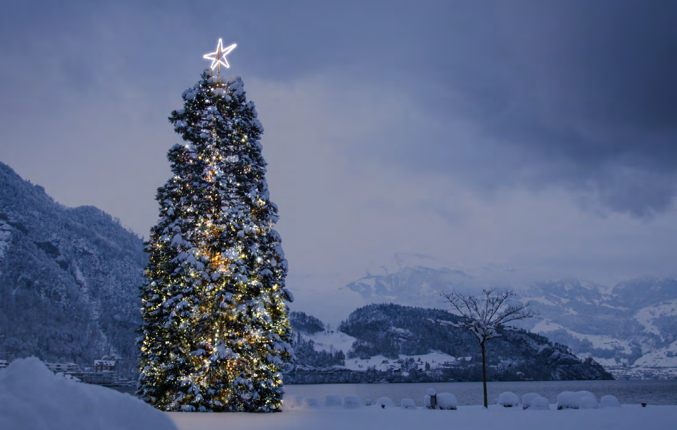
Majestic Winter Wonderland