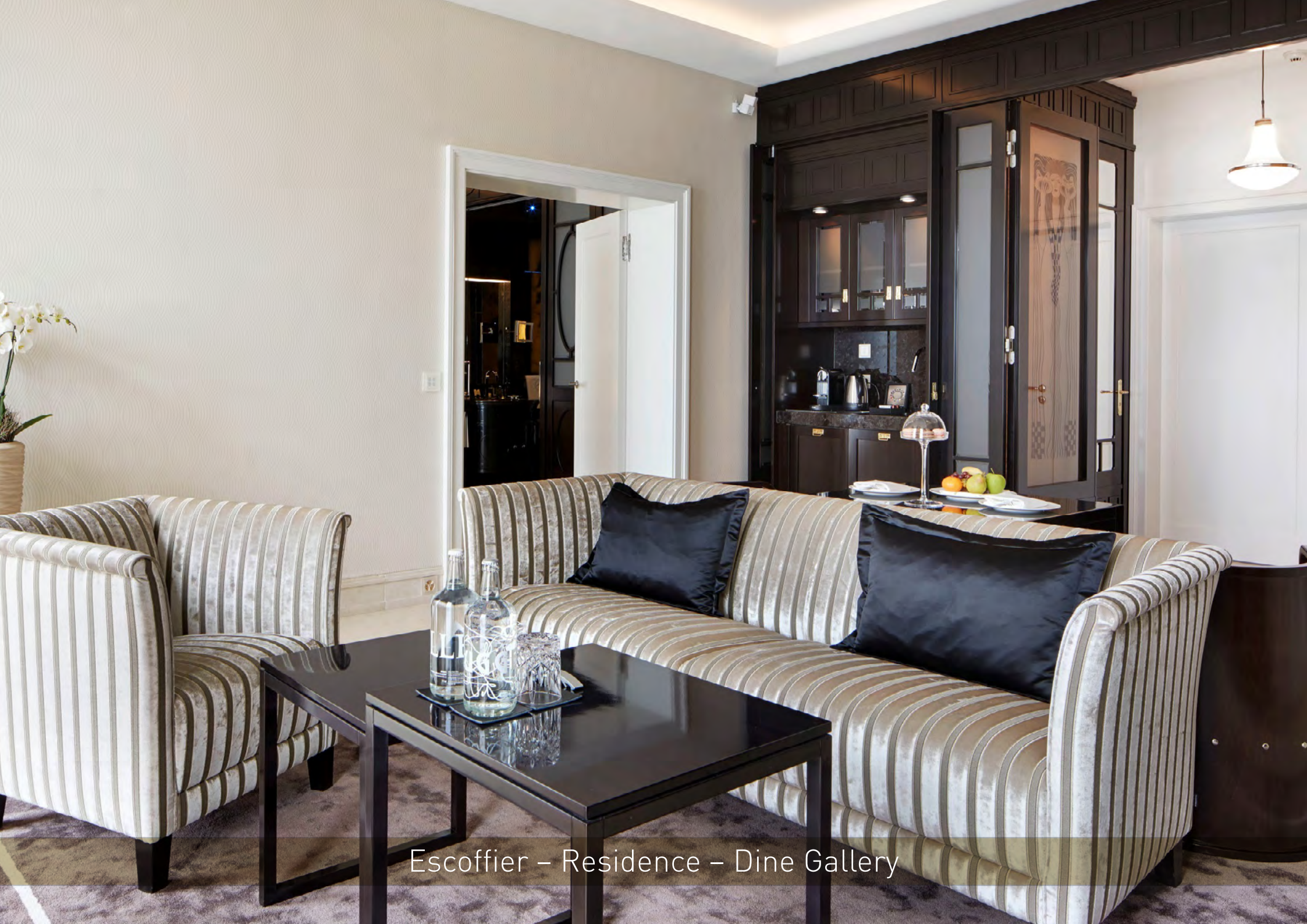
Escoffier – Residence – Dine Gallery