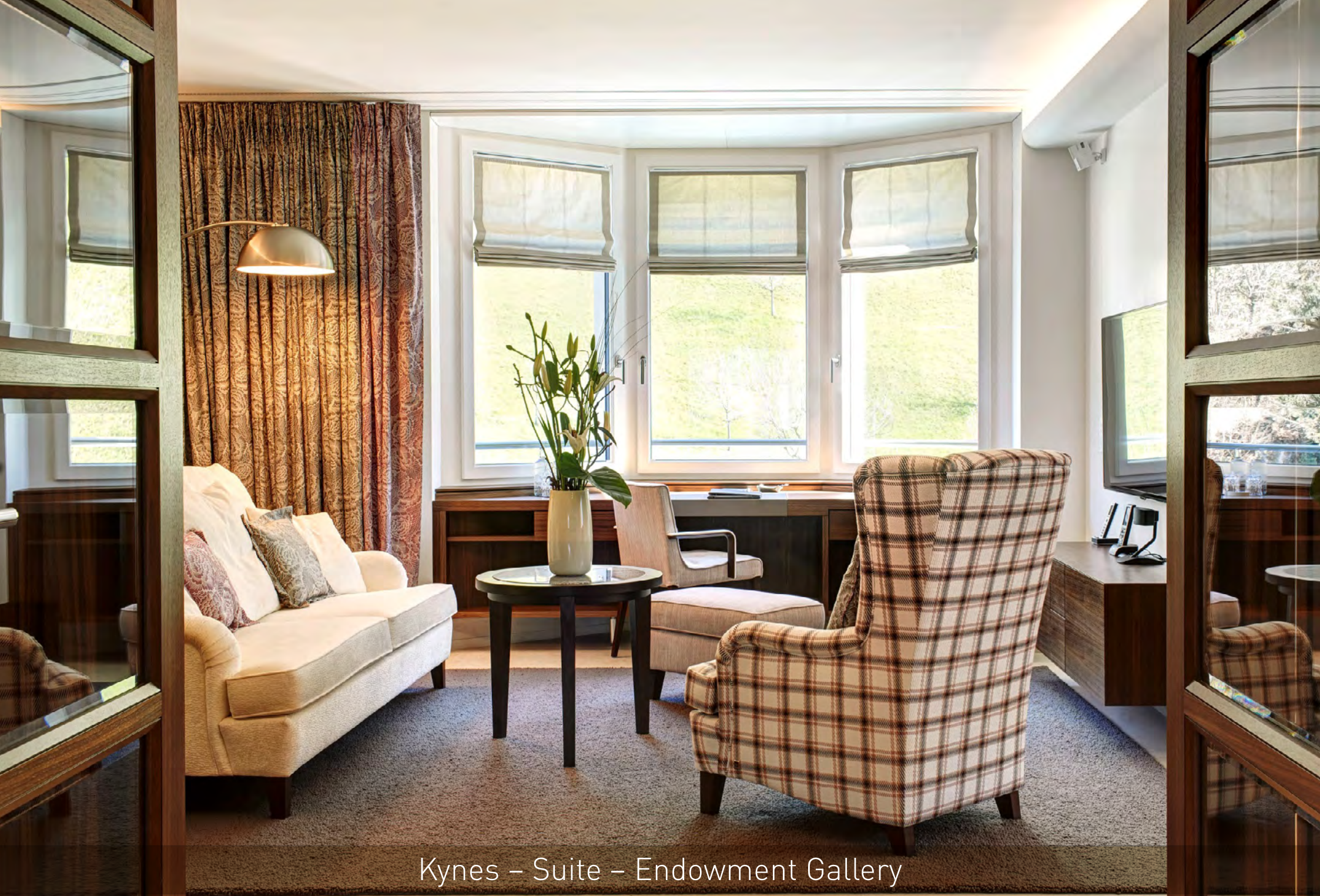
Kynes – Suite – Endowment Gallery