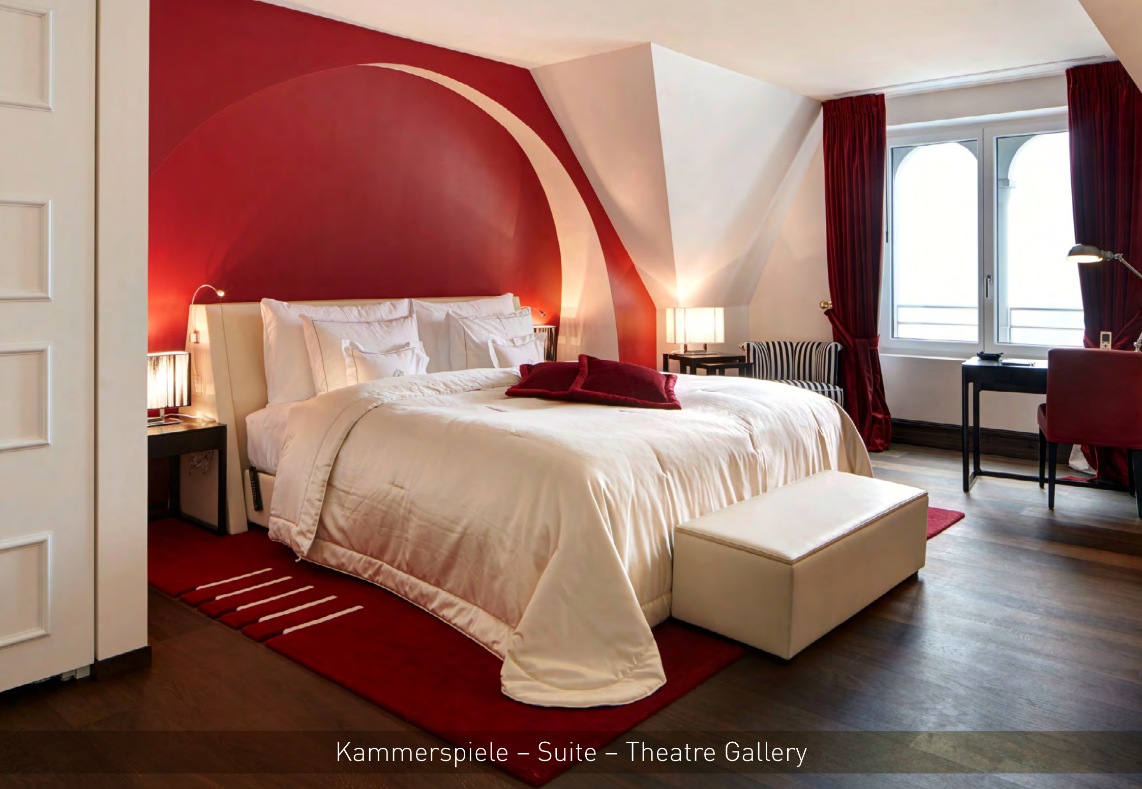
Kammerspiele – Suite – Theatre Gallery