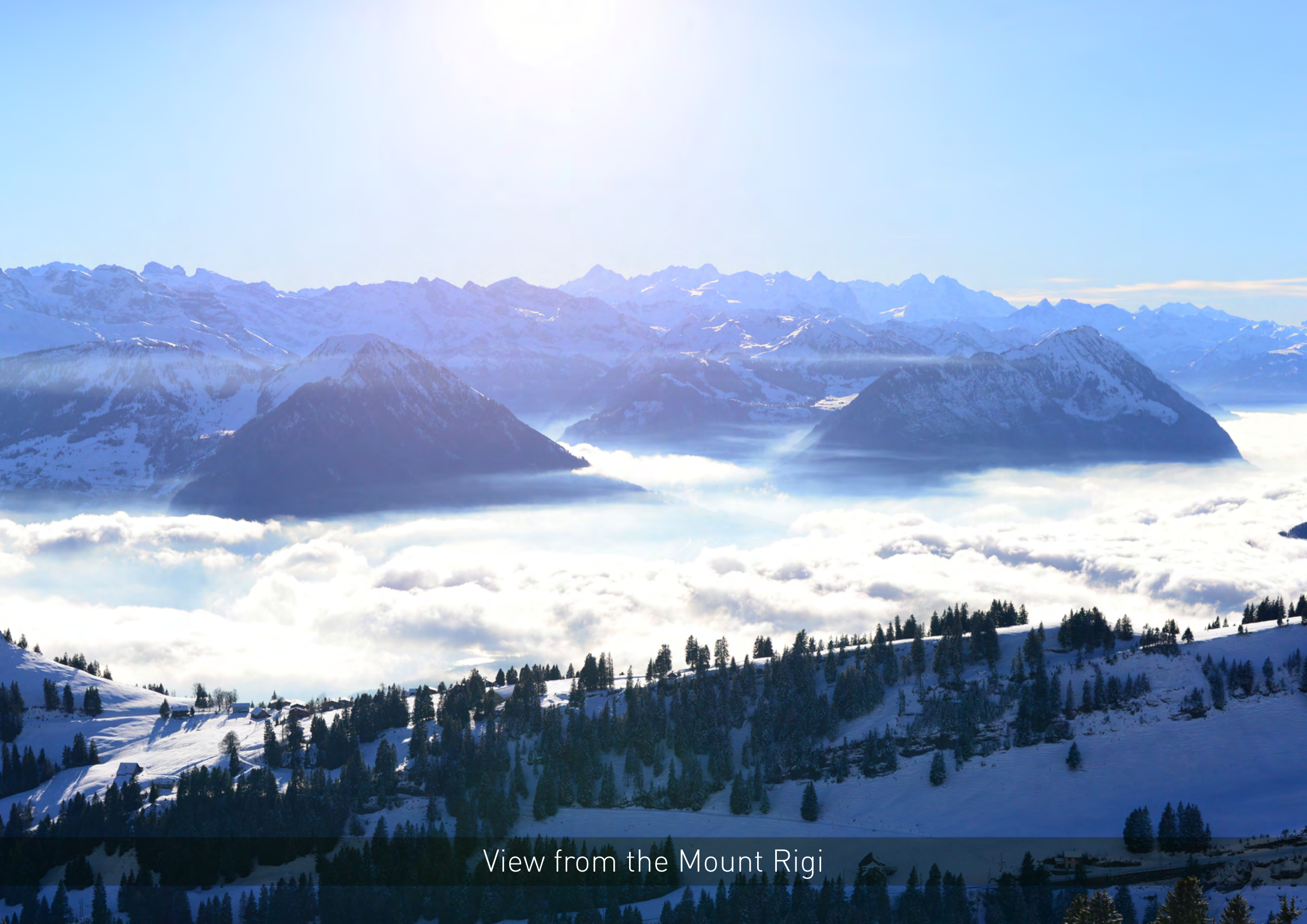
View from the Mount Rigi