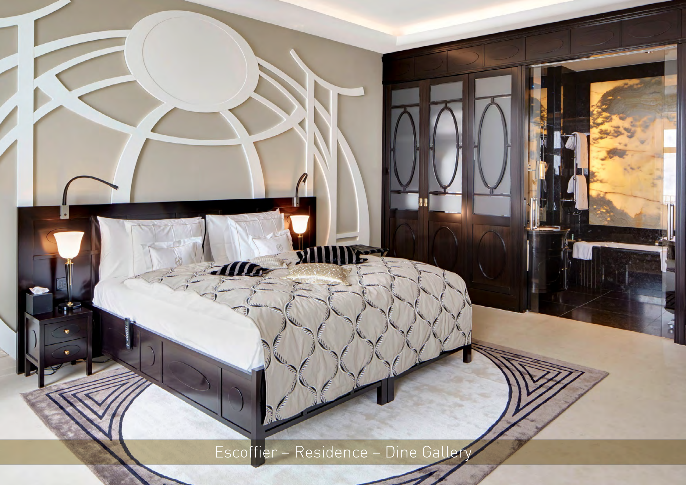
Escoffier – Residence – Dine Gallery