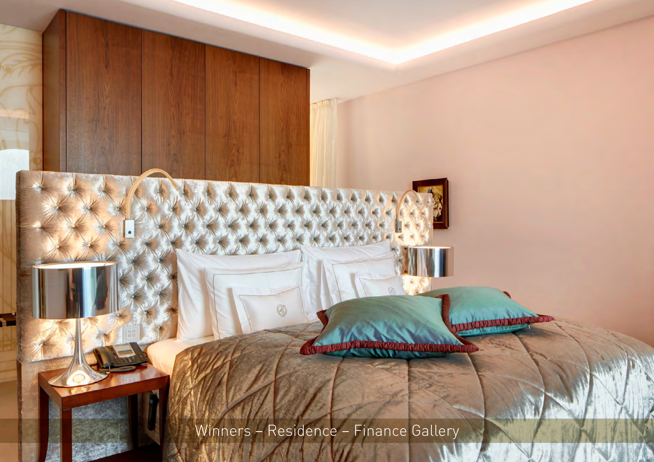
Winners – Residence – Finance Gallery